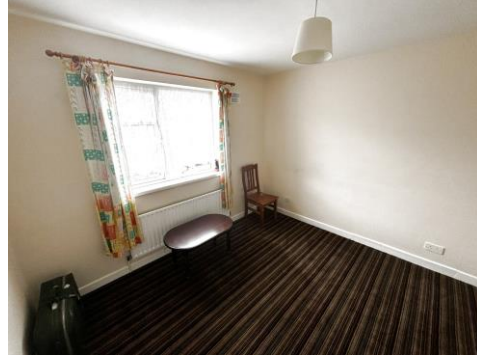
Bedrooms 1, 2 & 3