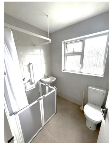
Landing and Bathroom