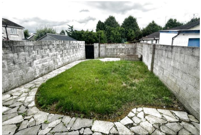
Walled in front & rear garden, with parking for 1-2 cars.