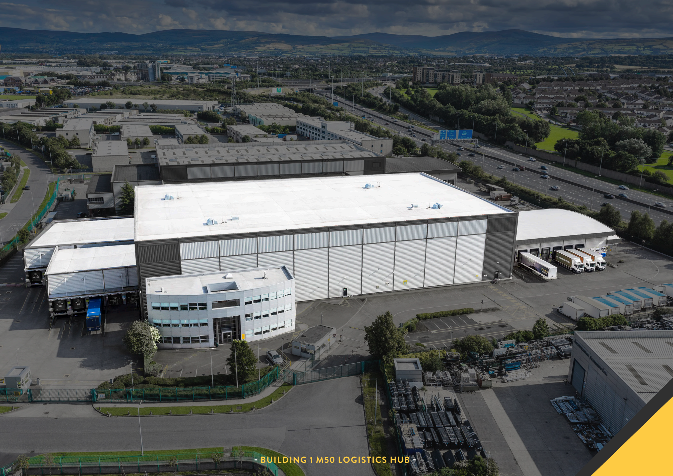
- BUILDING 1 M50 LOGISTICS HUB -