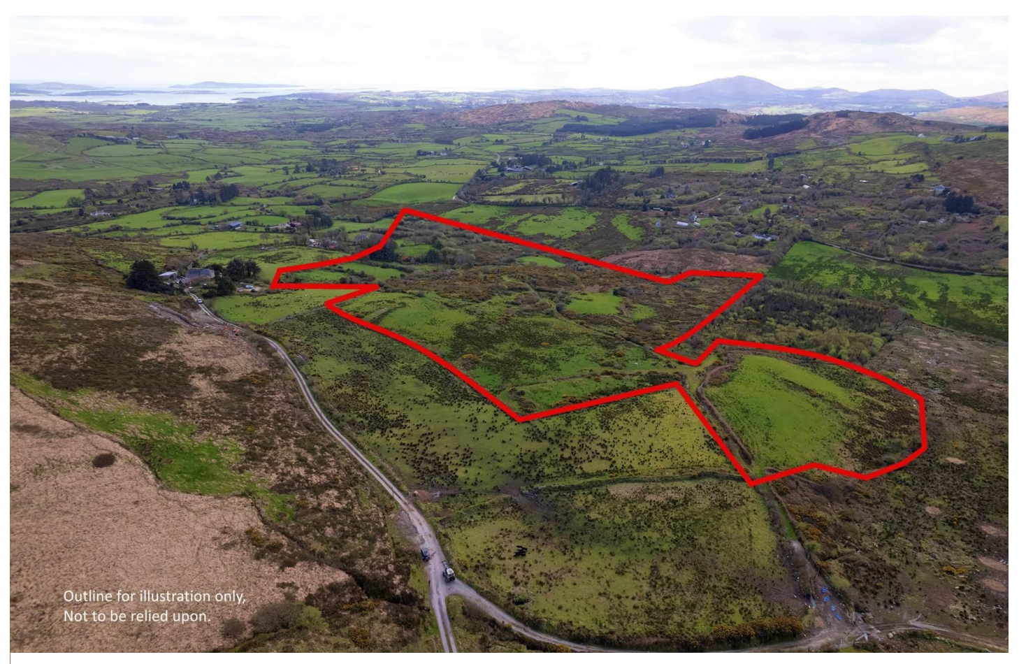
RESIDENTIAL FARM HOLDING - 33 ACRES

FARM HOLDING CONTAINING 33 ACRES OF LANDS, LOCATED 4 MILES NORTH EAST OF BALLYDEHOB VILLAGE.