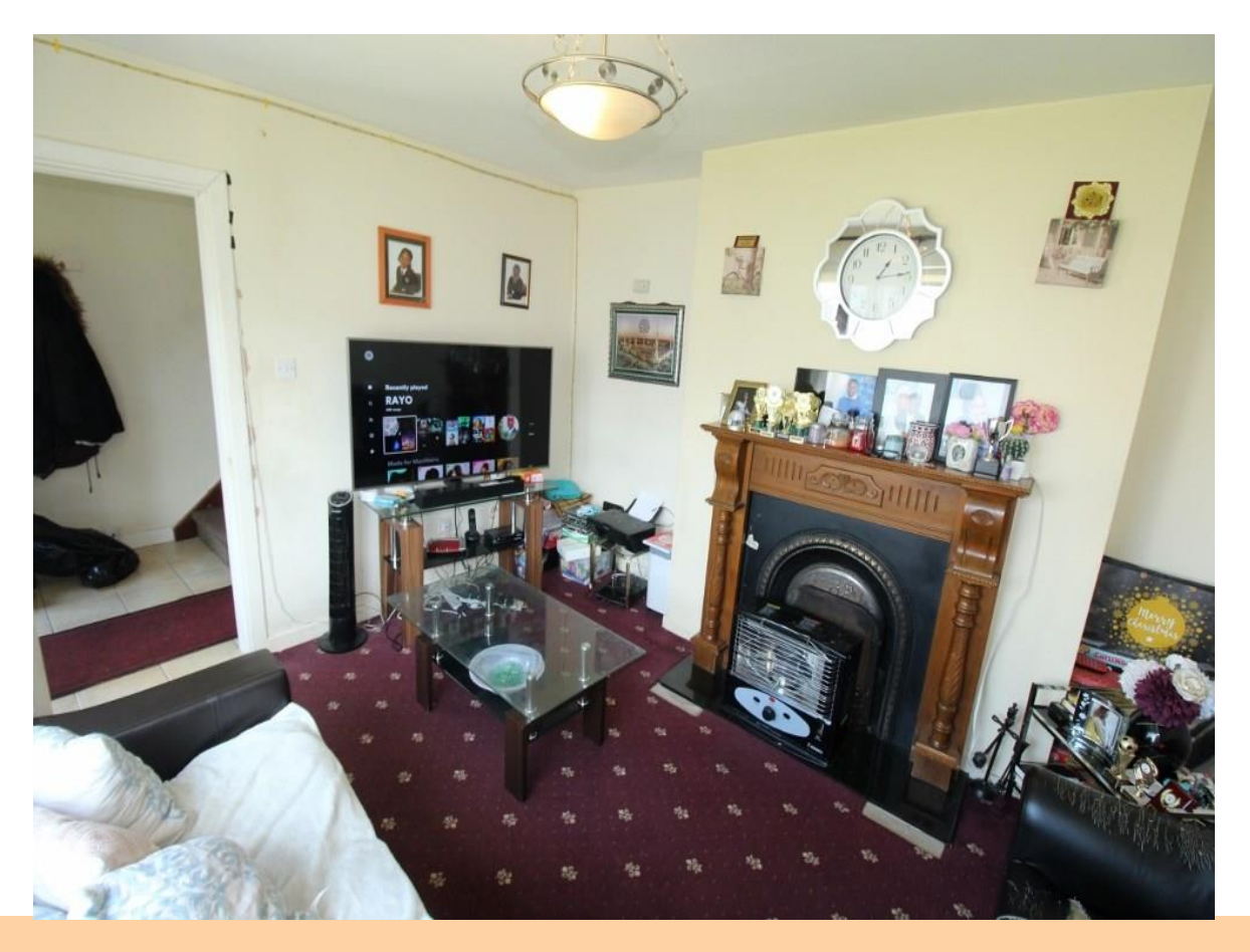
54a Cypress Gardens, Athlone, N37 VK79