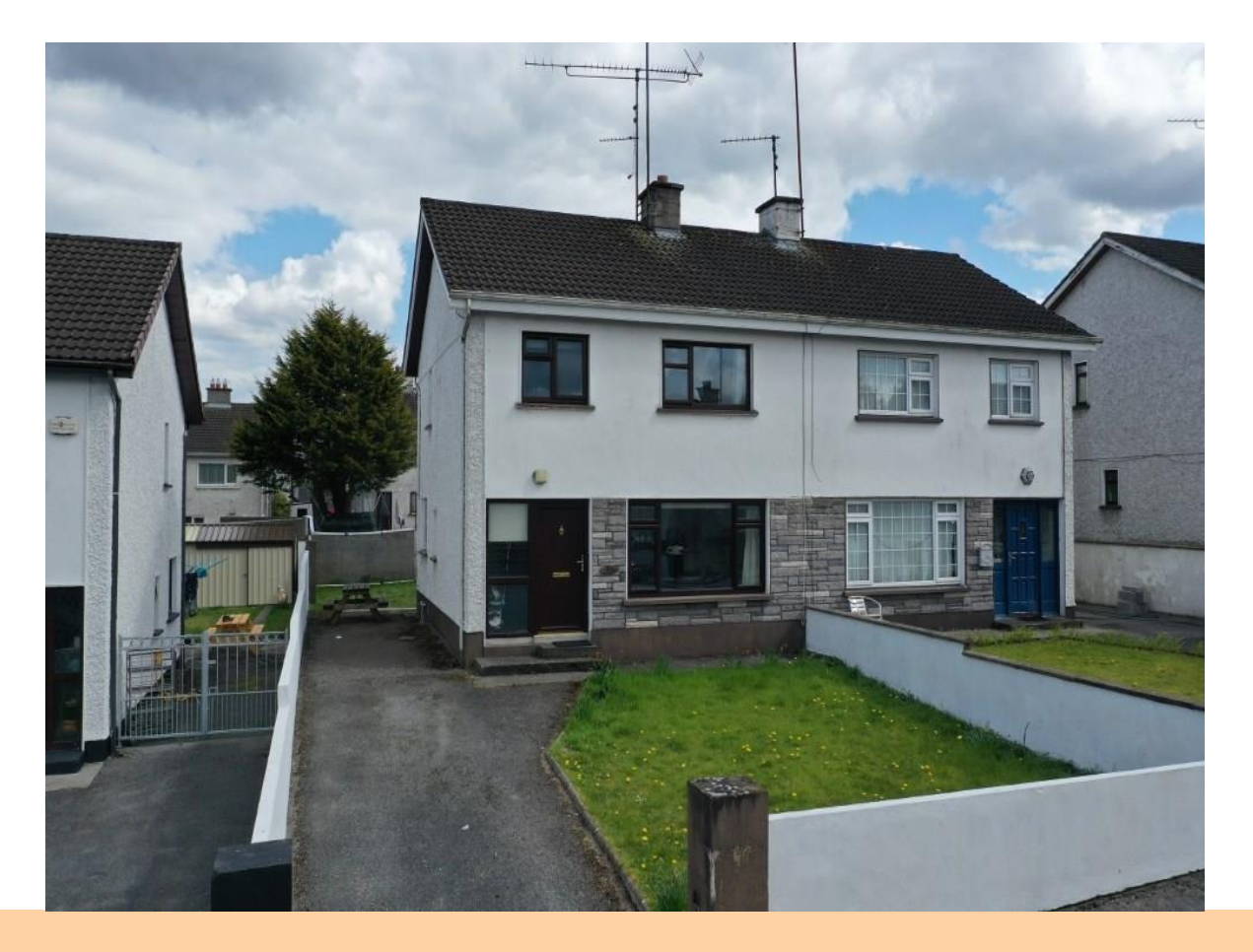
54a Cypress Gardens, Athlone, N37 VK79