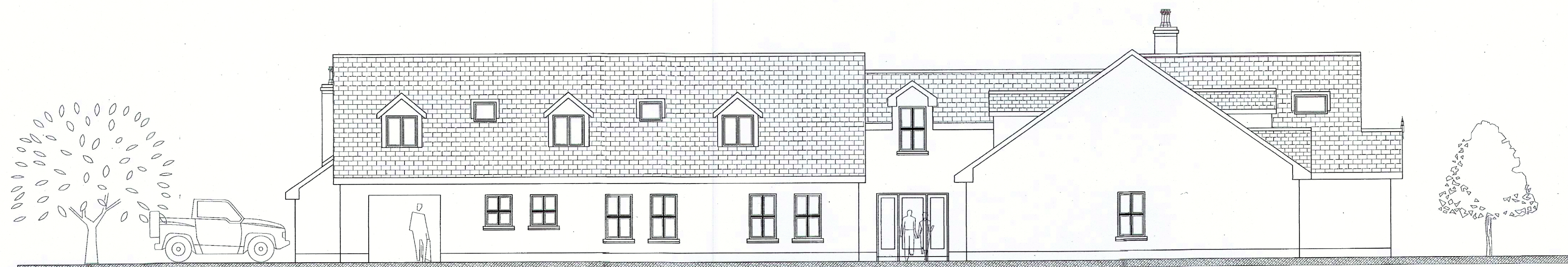
SIDE ELEVATION / SOUTH.