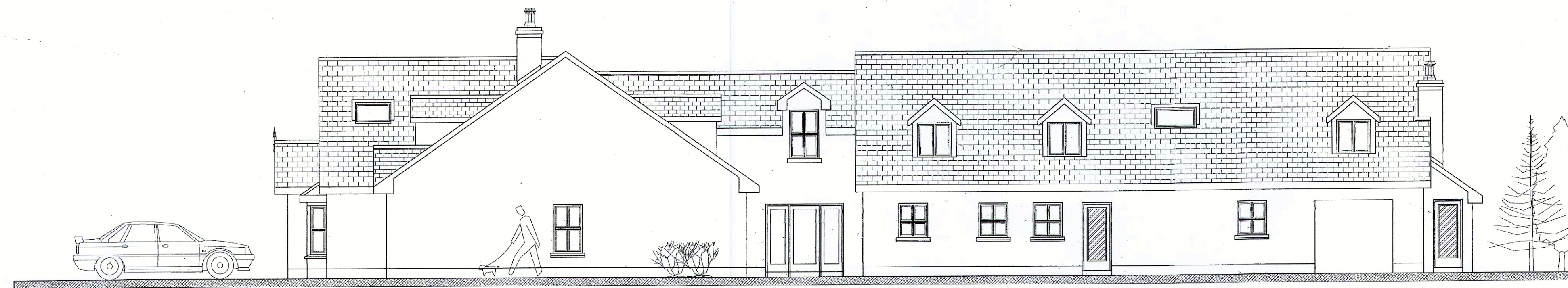
SIDE ELEVATION / SOUTH.