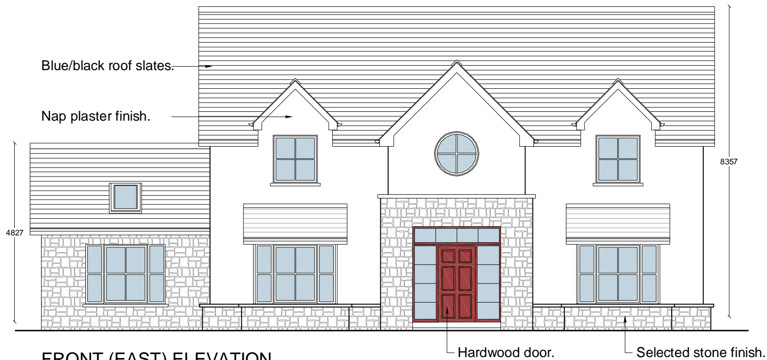
FRONT (EAST) ELEVATION