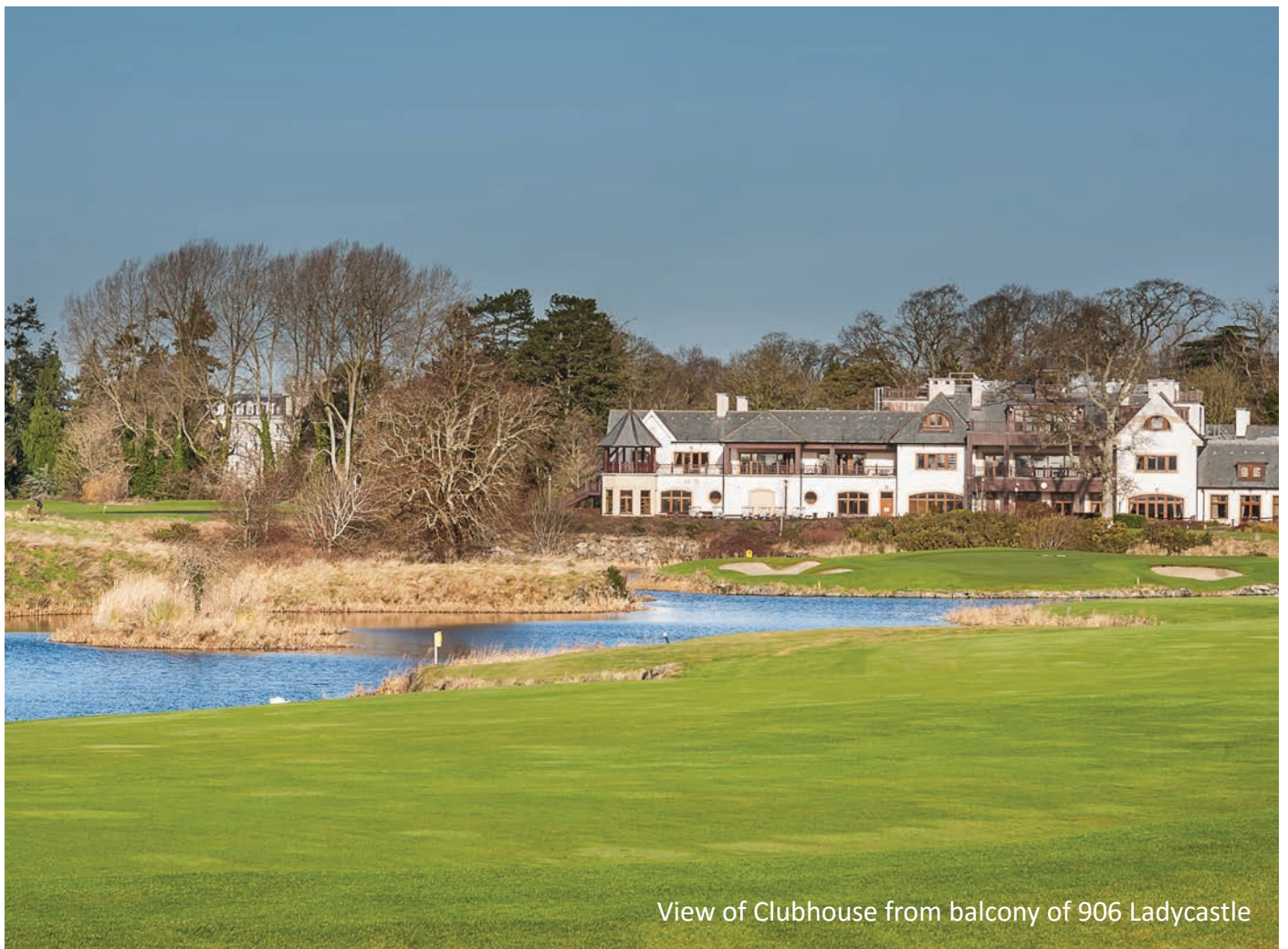
View of Clubhouse from balcony of 906 Ladycastle