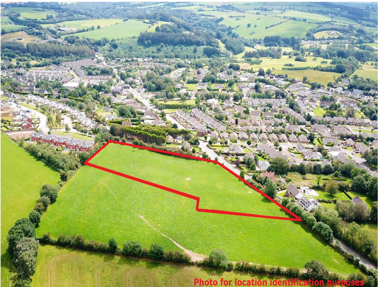
Photo for location identification purposes

Strategically located land within the development boundary