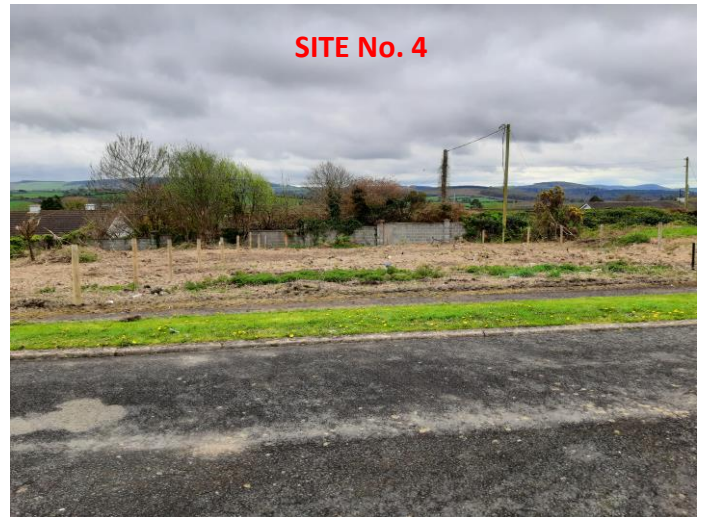
SITE No. 4