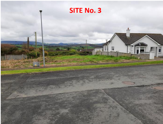
SITE No. 3