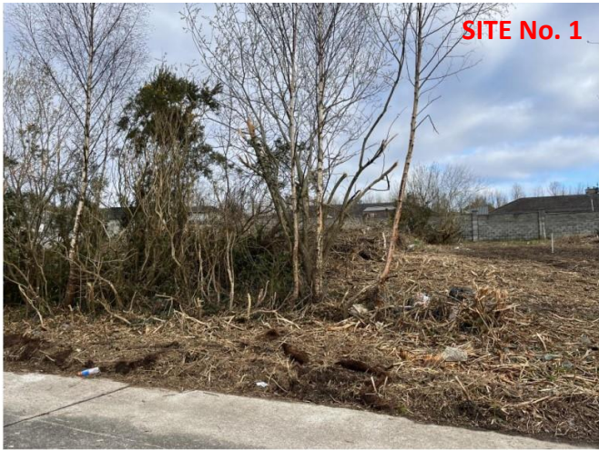
SITE No. 1