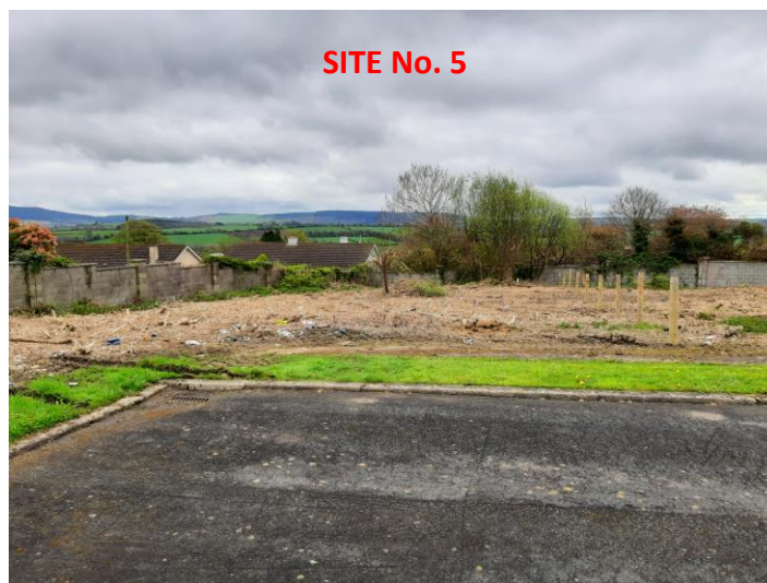
SITE No. 5

A.M.Kiersey Limited: C.R.O. reg no: 409002. VAT. reg no: 6429002V