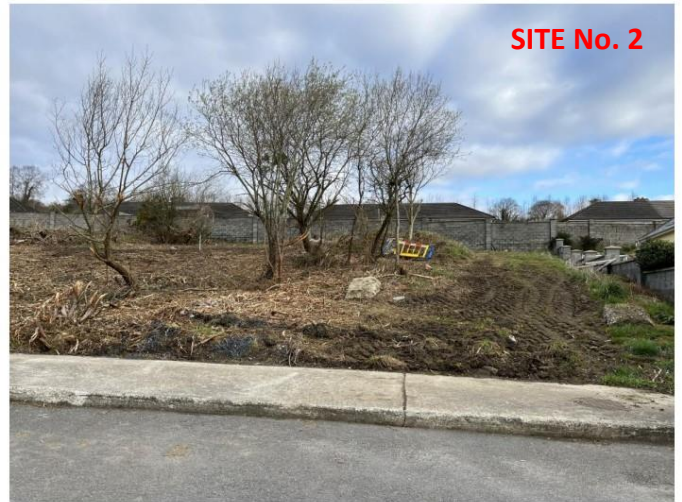
SITE No. 2