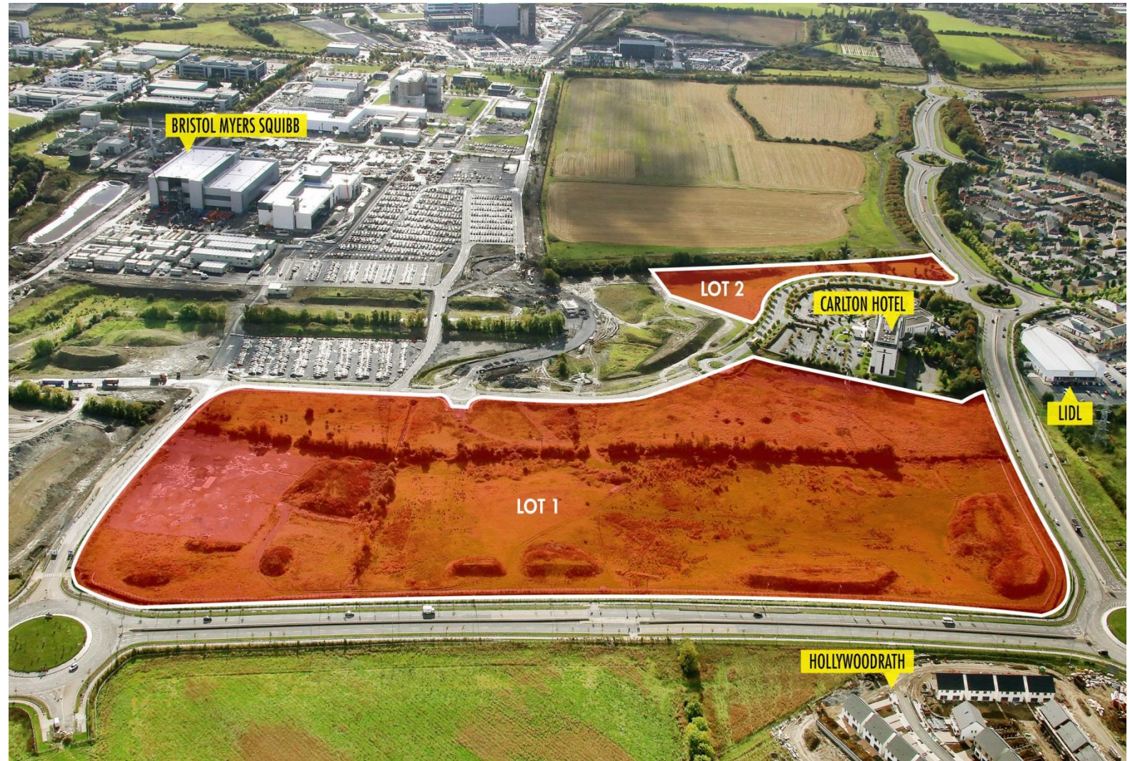
Aerial Photo – For identification purposes only