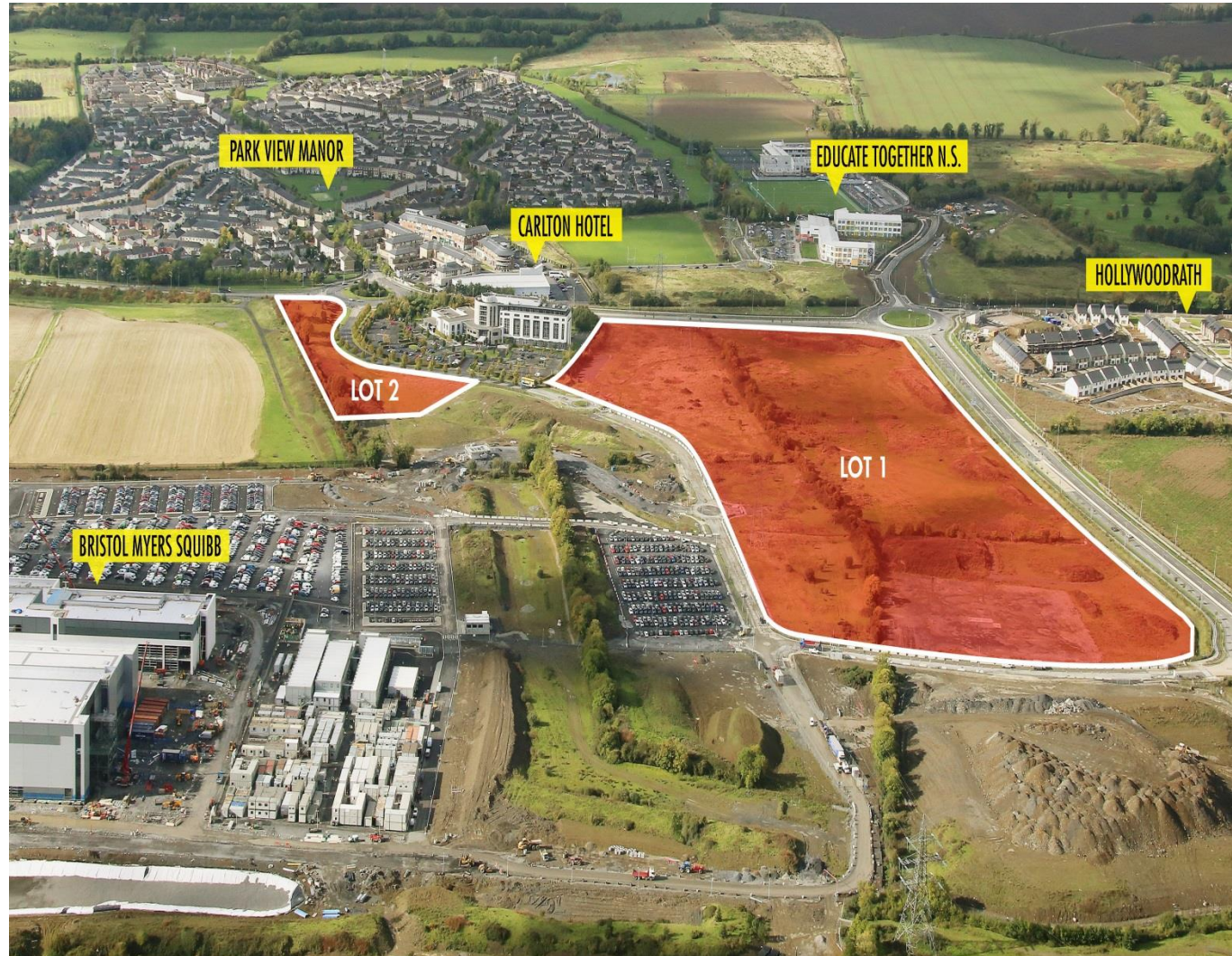
Aerial Photo – for identification purposes only

Jarlath Lynn Industrial t: 01 6185728 e: jarlath.lynn@cbre.com