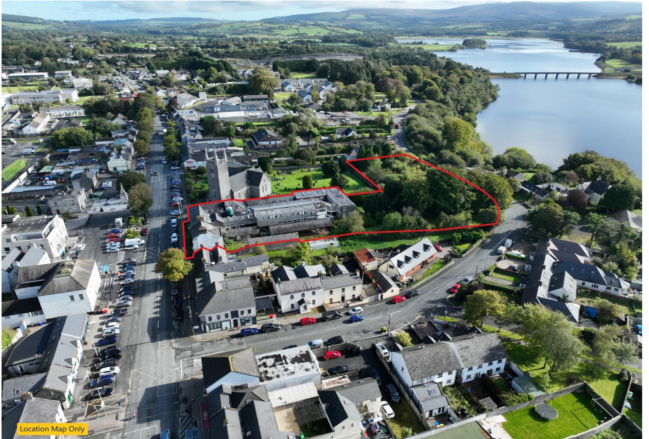
Location Map Only