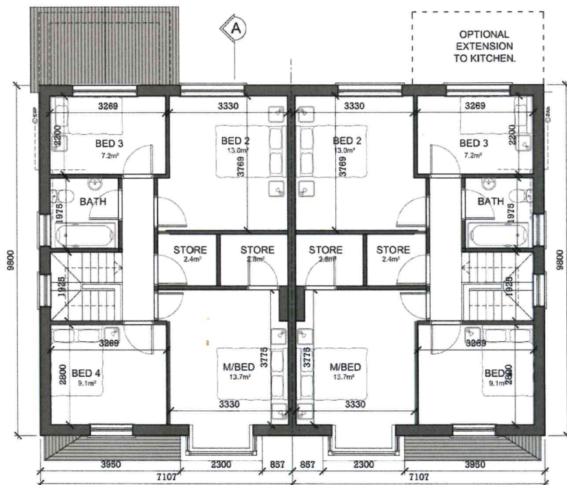
FIRST FLOOR PLAN 1:100