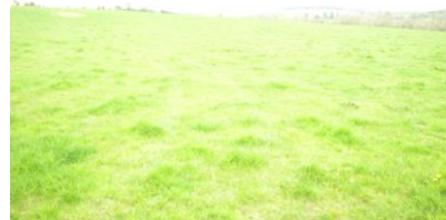
Laneway access to the house (pic 1) / Image of lands (pic 2)