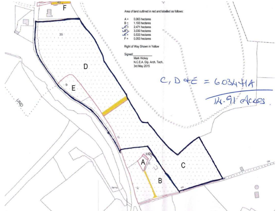
Map above shows Plots C, D & E as 6.03 ha / 14.91 Acres