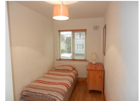
Bedrooms 1 and 2

Bedroom 3 12'11" x 9'04" (3.65 x 2.74) Laminate flooring.