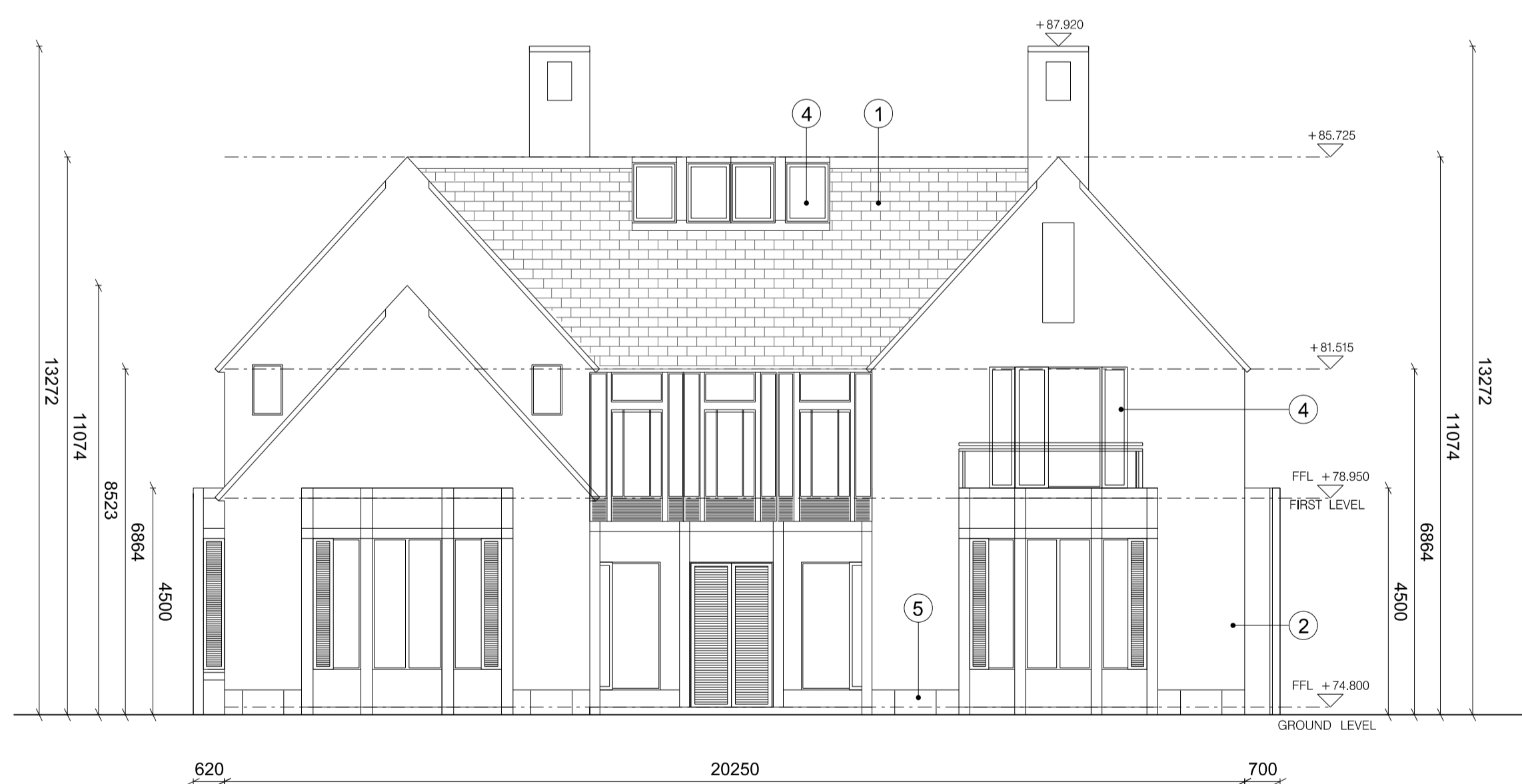
1 ELEVATION E3 1:100