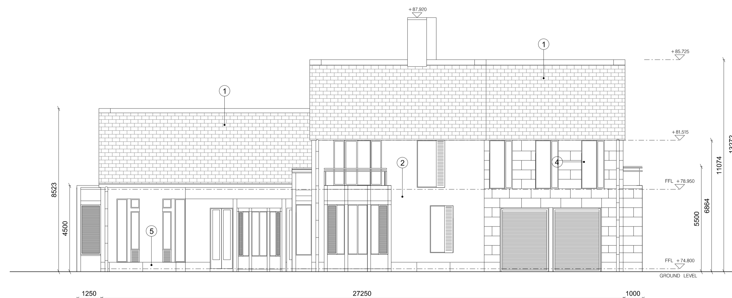
1 ELEVATION E4 1:100