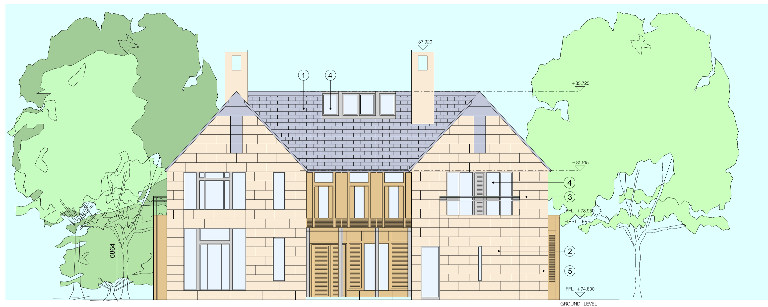
1 ELEVATION E1 1:100