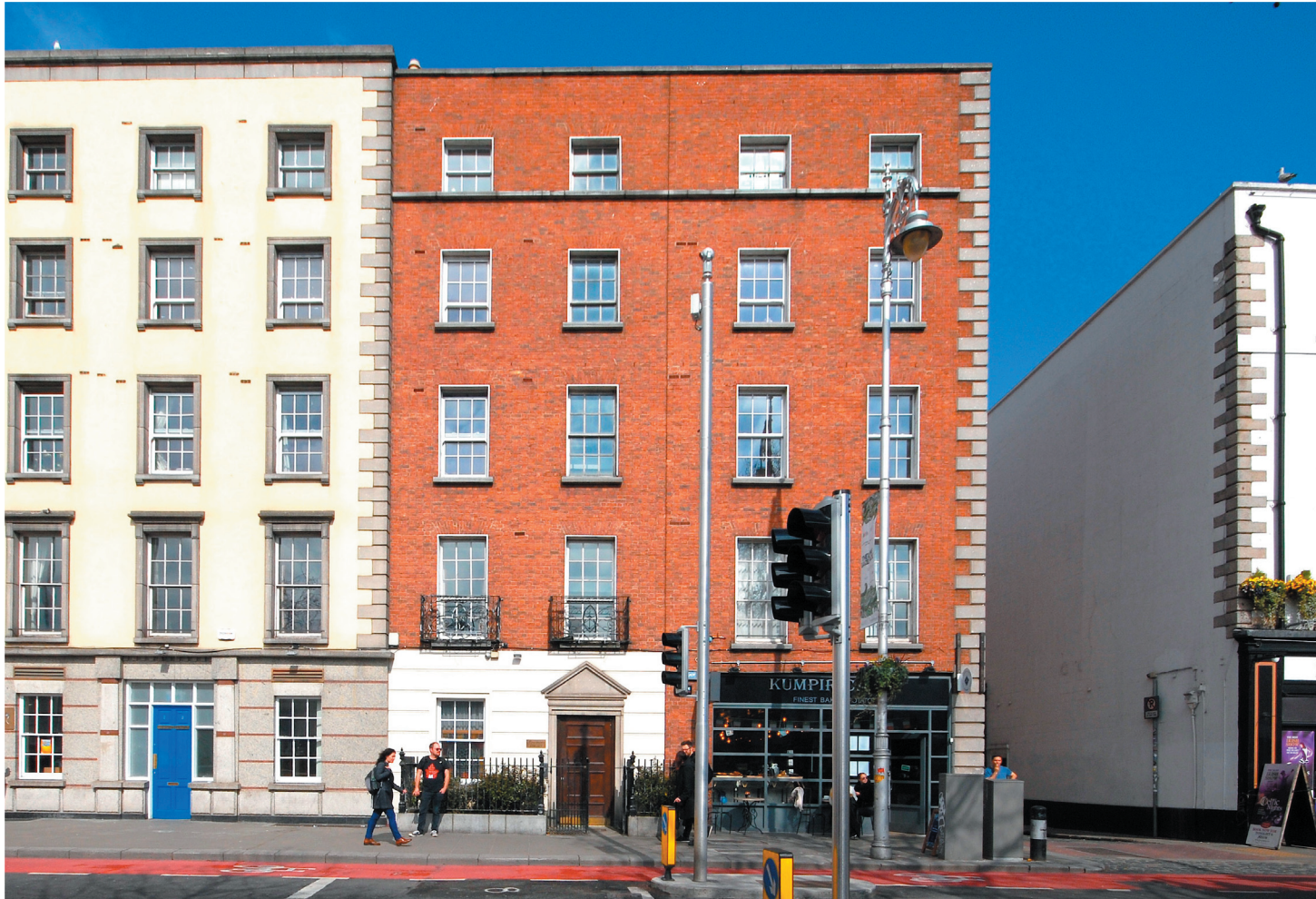
Apartment 155 Bachelors Walk Dublin 1