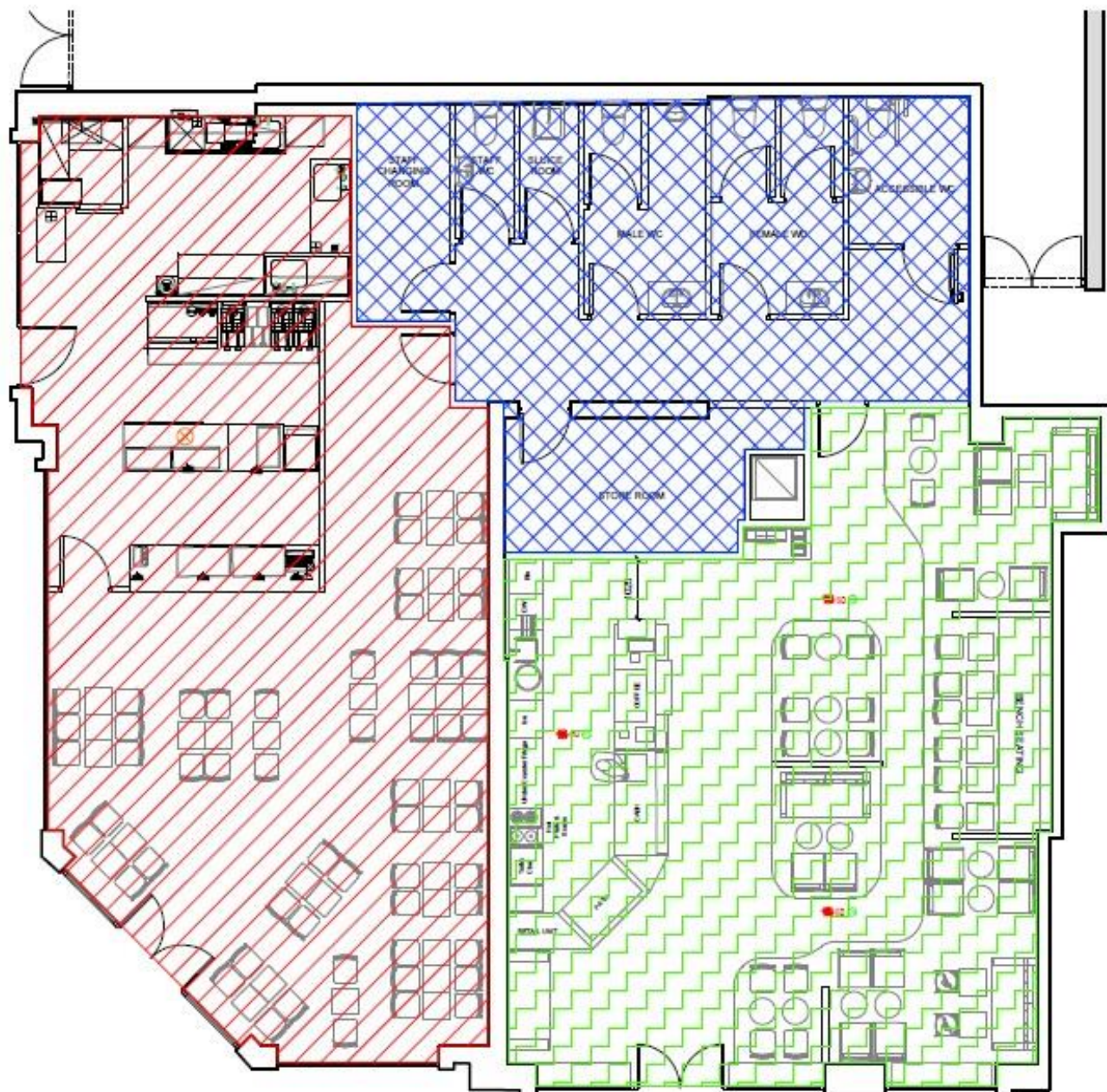
PROPOSED FLOOR PLANS