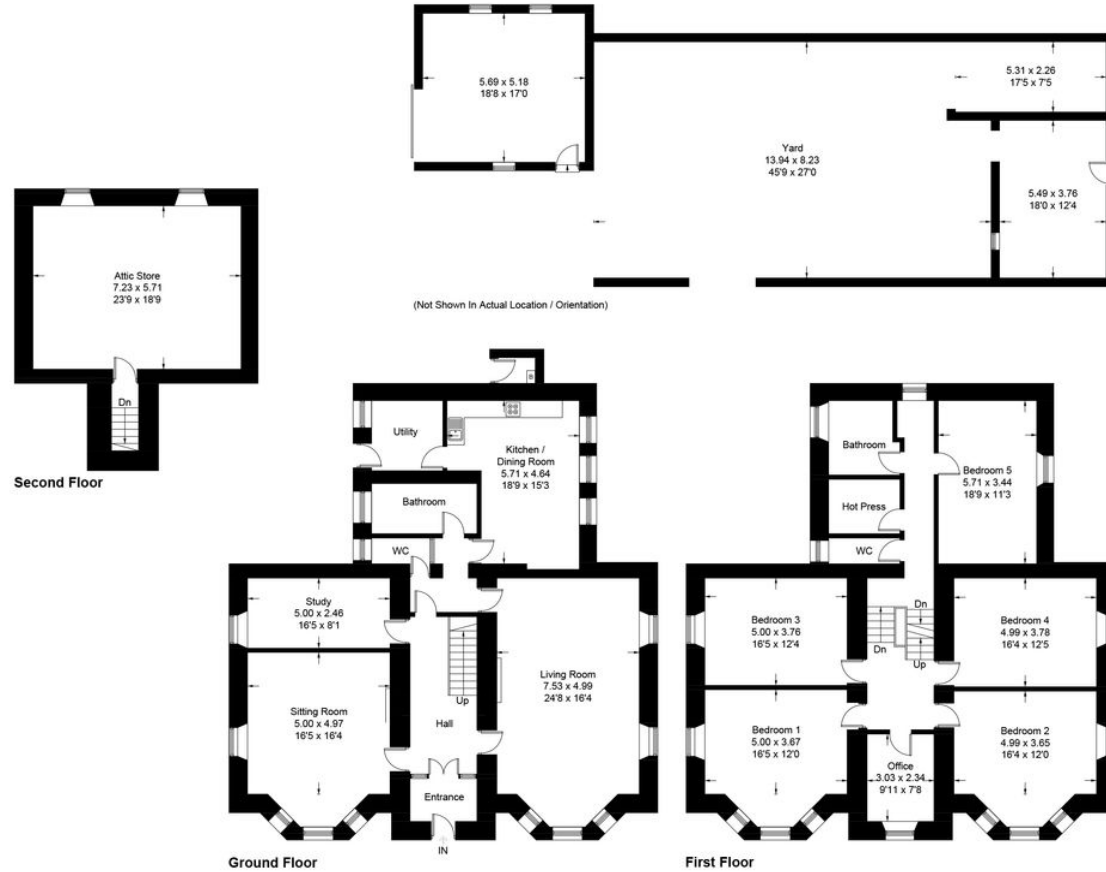
Illustration for identification purposes only, measurements are approximate, not to scale. floorplansUsketch.com © (ID1084048)