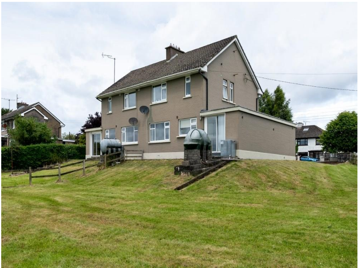
4 St. Mary's Avenue, Ballyleague, N39 FH79