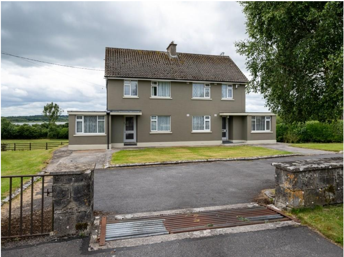
4 St. Mary's Avenue, Ballyleague, N39 FH79