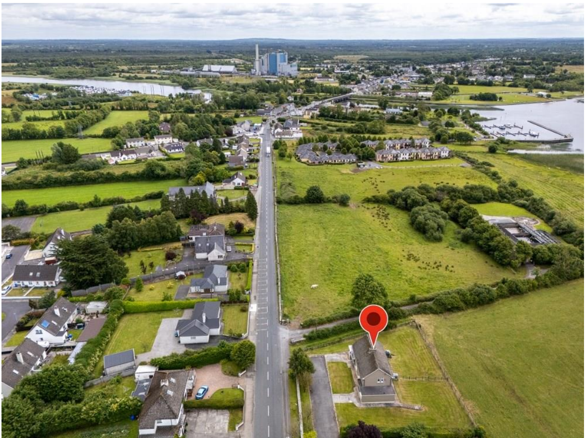
4 St. Mary's Avenue, Ballyleague, N39 FH79