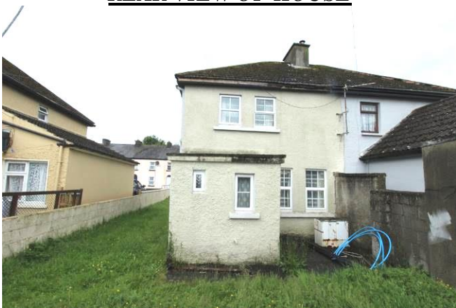
REAR VIEW OF HOUSE