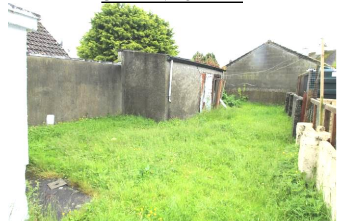
GARDEN TO REAR