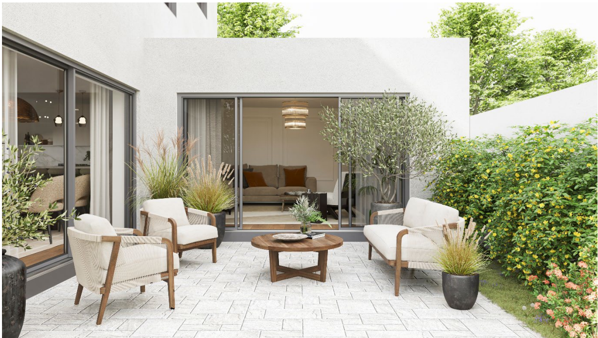
The landscaped courtyard garden promotes seamless indoor/outdoor luxury living