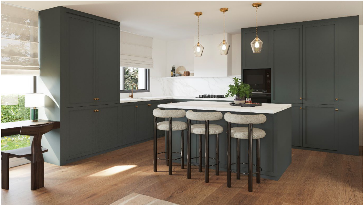
The bespoke shaker style kitchen showcases serious attention to detail while allowing for custom colour and finish selections