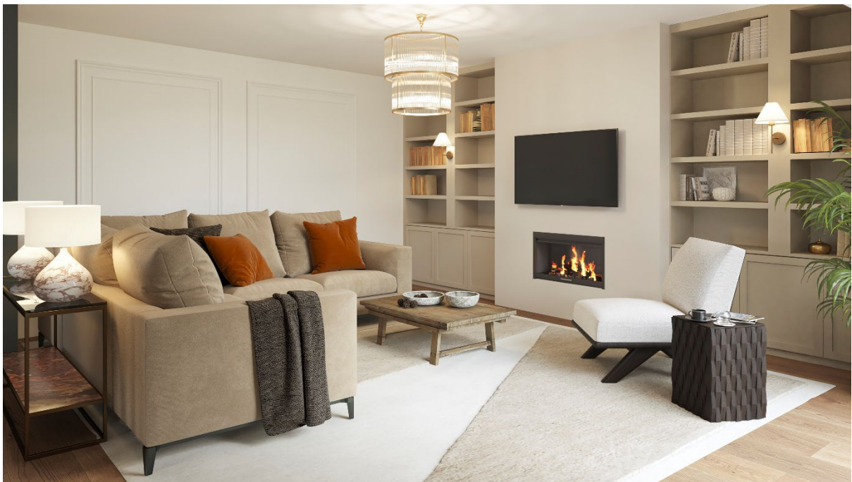
The luxurious living space exudes warmth and sophistication with bespoke joinery as standard