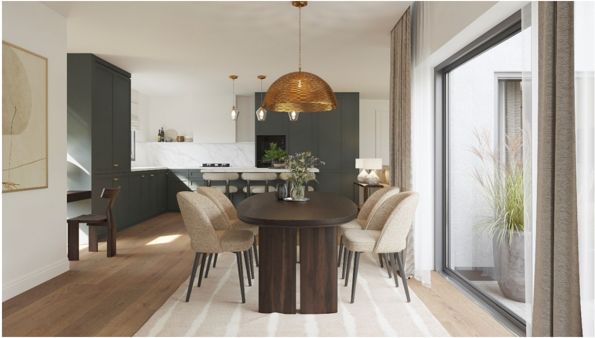
Entertaining scope and space to be truly proud of with indoor/outdoor harmony and flow at the core