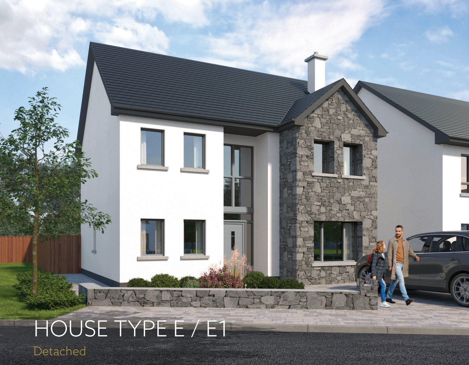
HOUSE TYPE E / E1 Detached