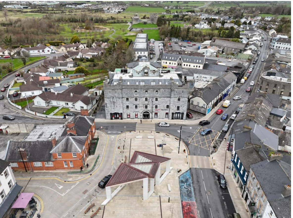
7 Stonecourt, The Square, Roscommon Town. F42 P684