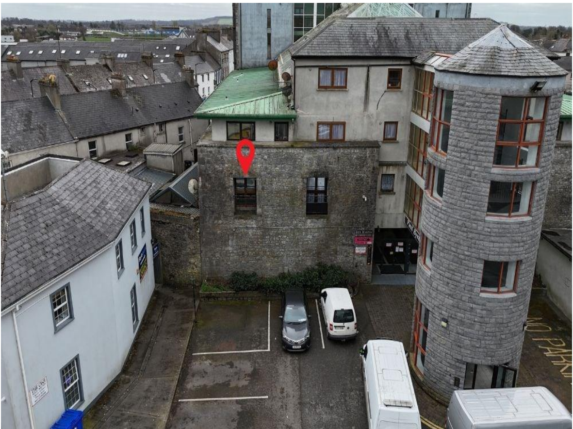
7 Stonecourt, The Square, Roscommon Town. F42 P684