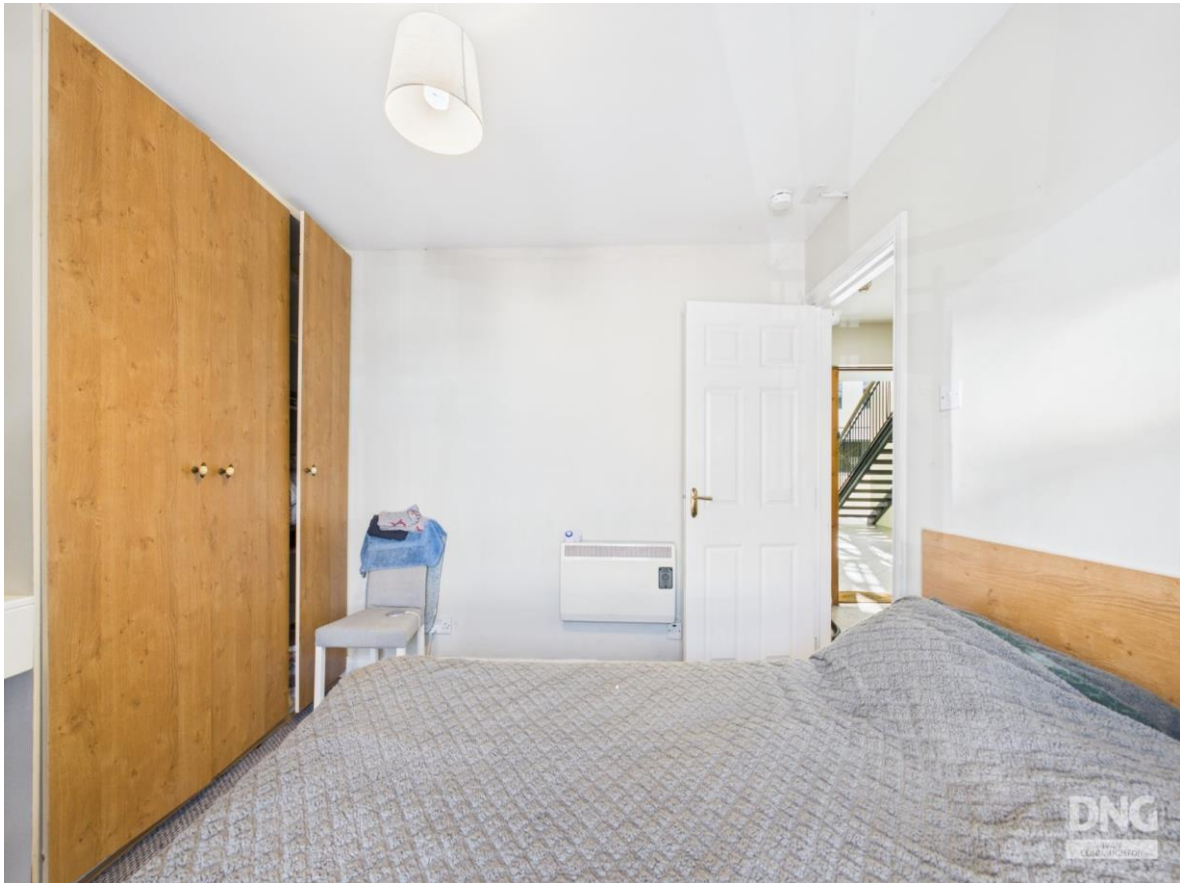
7 Stonecourt, The Square, Roscommon Town. F42 P684