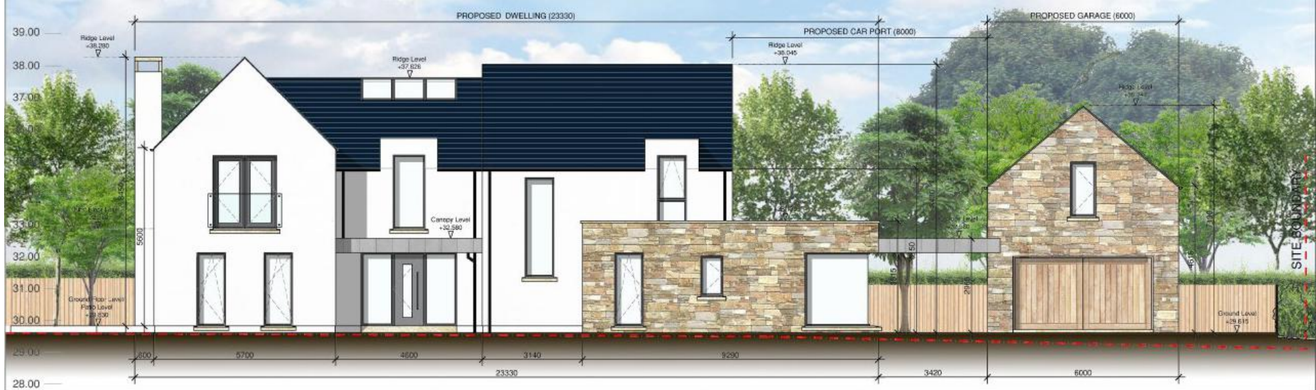
Front Elevation (South East), 1:100