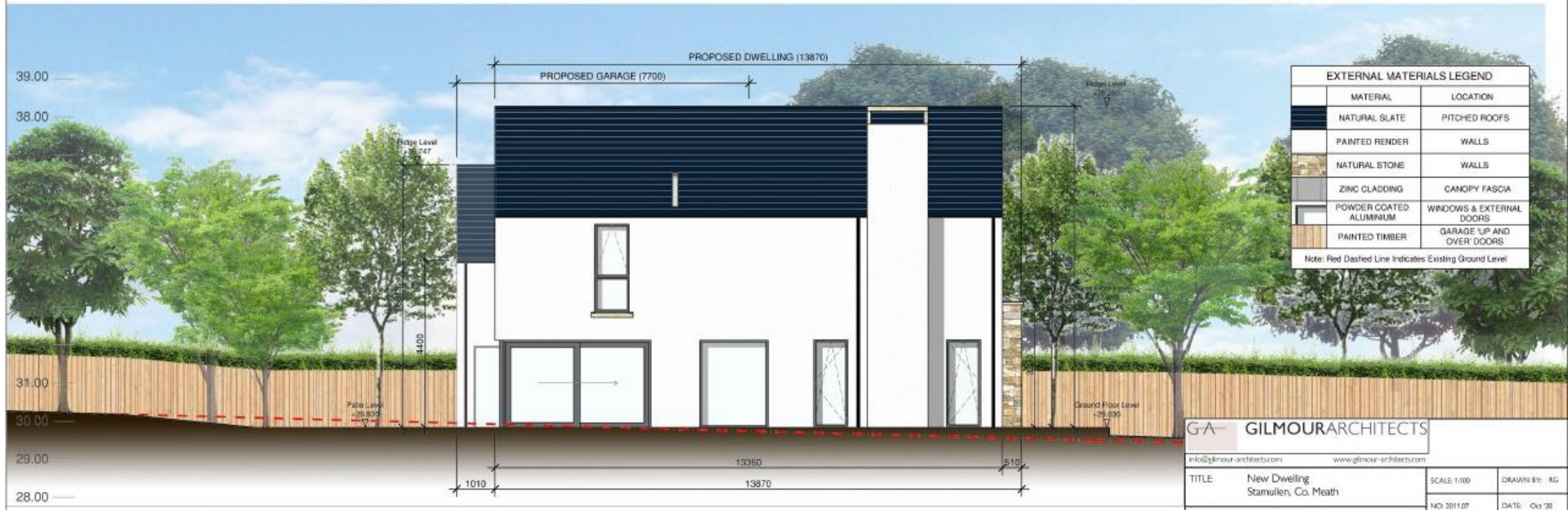
Side Elevation (South West), 1:100