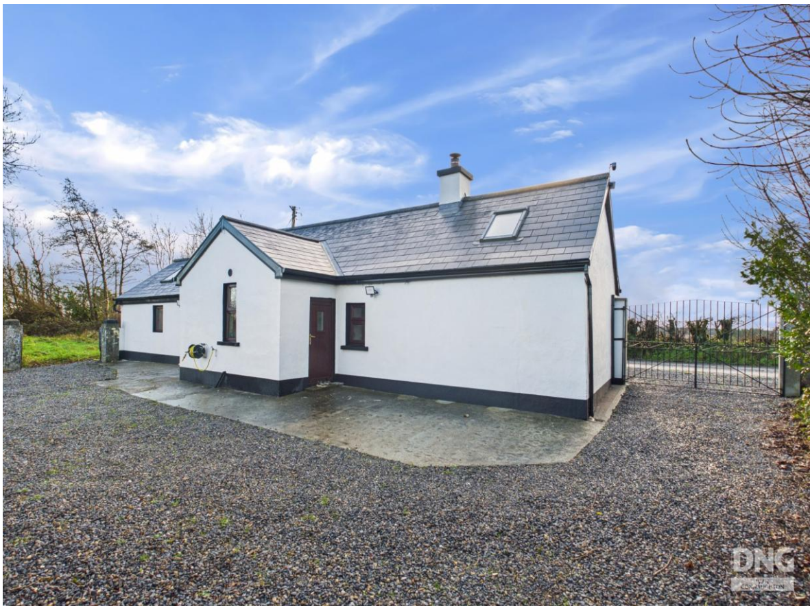
Annagh Cottage on c. 2.66 Acres, Trien, Castlerea, Co. Roscommon. F45 DP83