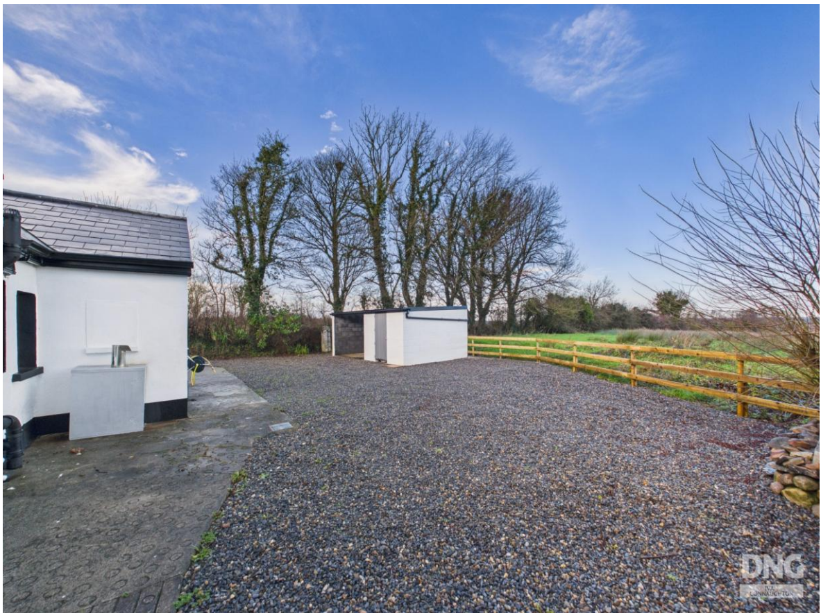
Annagh Cottage on c. 2.66 Acres, Trien, Castlerea, Co. Roscommon. F45 DP83