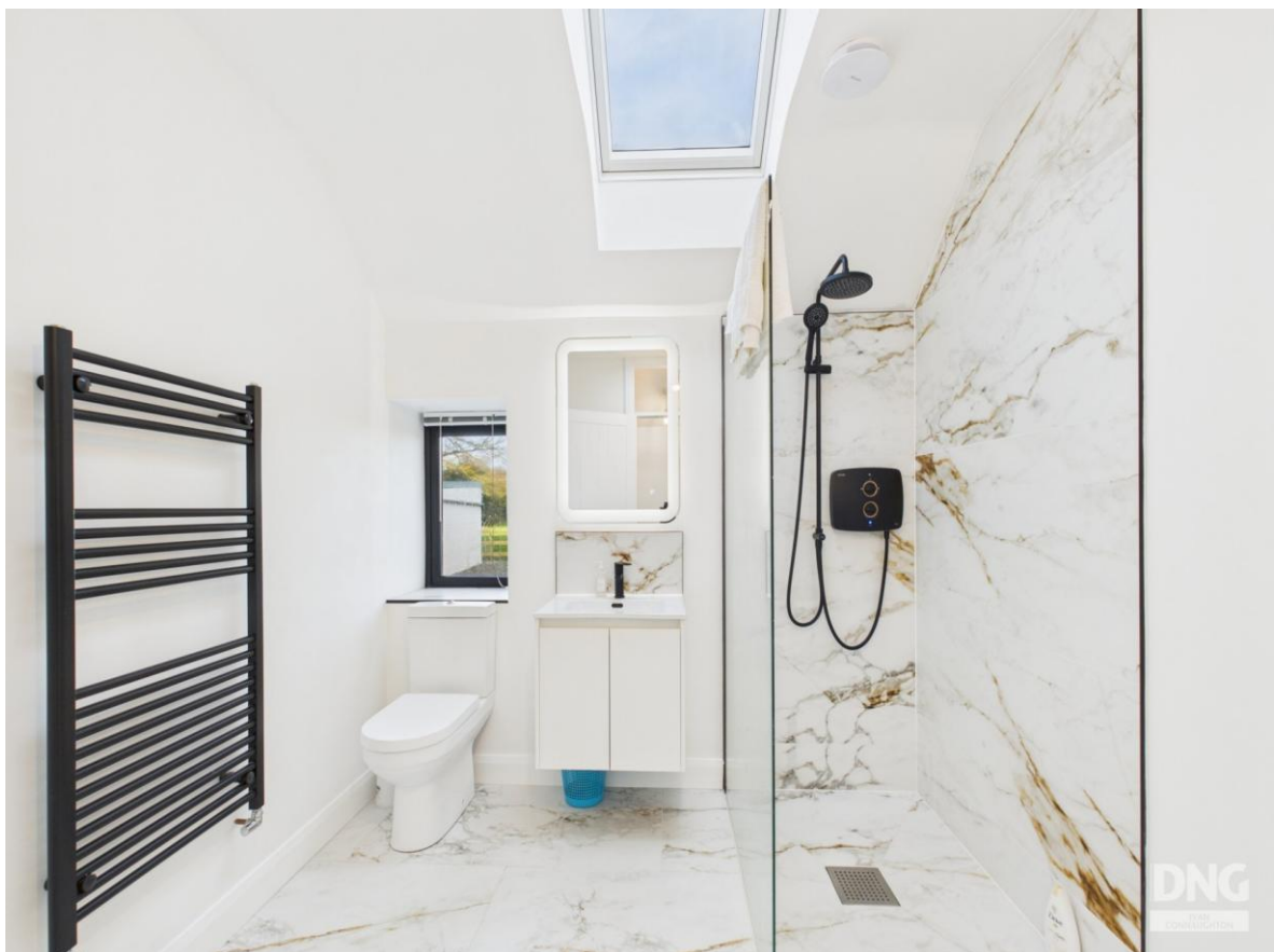
Annagh Cottage on c. 2.66 Acres, Trien, Castlerea, Co. Roscommon. F45 DP83