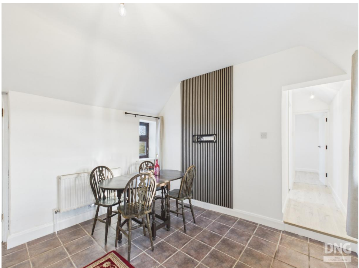
Annagh Cottage on c. 2.66 Acres, Trien, Castlerea, Co. Roscommon. F45 DP83