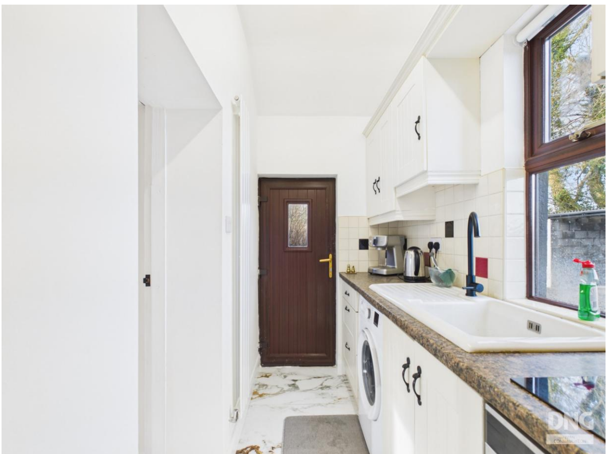
Annagh Cottage on c. 2.66 Acres, Trien, Castlerea, Co. Roscommon. F45 DP83