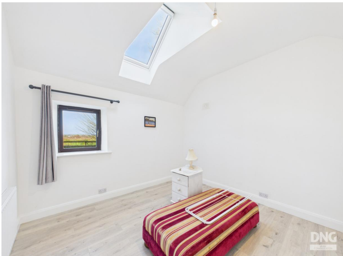
Annagh Cottage on c. 2.66 Acres, Trien, Castlerea, Co. Roscommon. F45 DP83