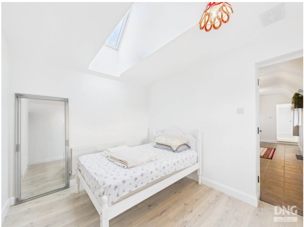
Annagh Cottage on c. 2.66 Acres, Trien, Castlerea, Co. Roscommon. F45 DP83