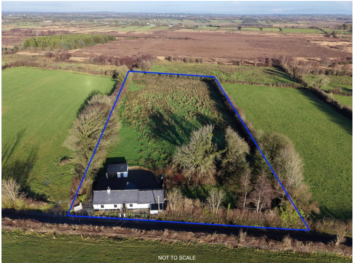
Annagh Cottage on c. 2.66 Acres, Trien, Castlerea, Co. Roscommon. F45 DP83