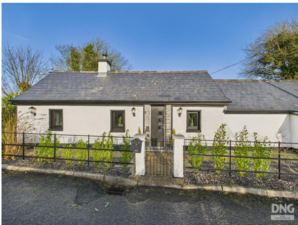
Annagh Cottage on c. 2.66 Acres, Trien, Castlerea, Co. Roscommon. F45 DP83