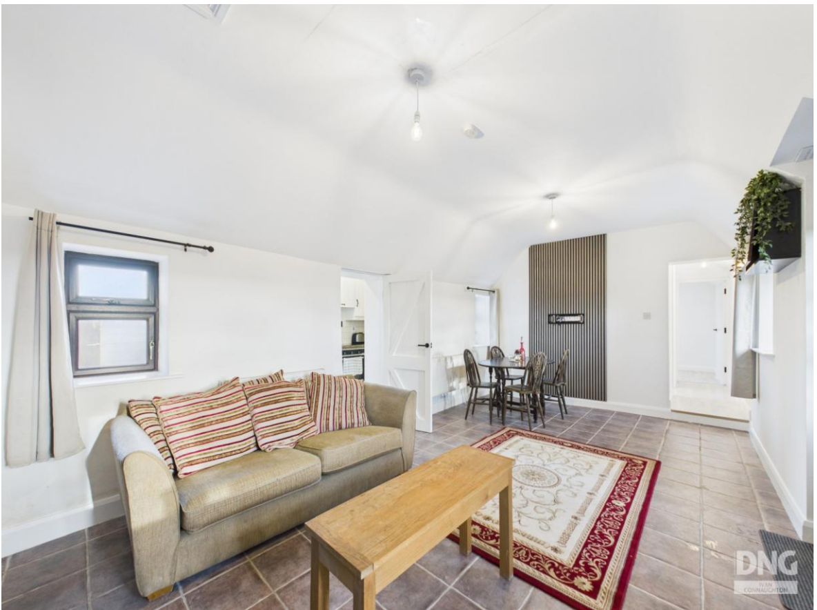
Annagh Cottage on c. 2.66 Acres, Trien, Castlerea, Co. Roscommon. F45 DP83