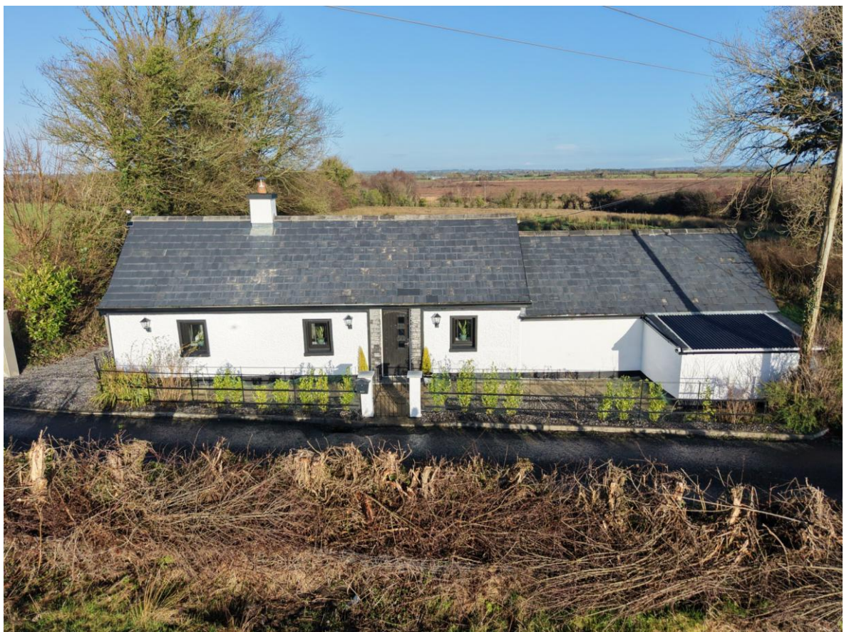
Annagh Cottage on c. 2.66 Acres, Trien, Castlerea, Co. Roscommon. F45 DP83