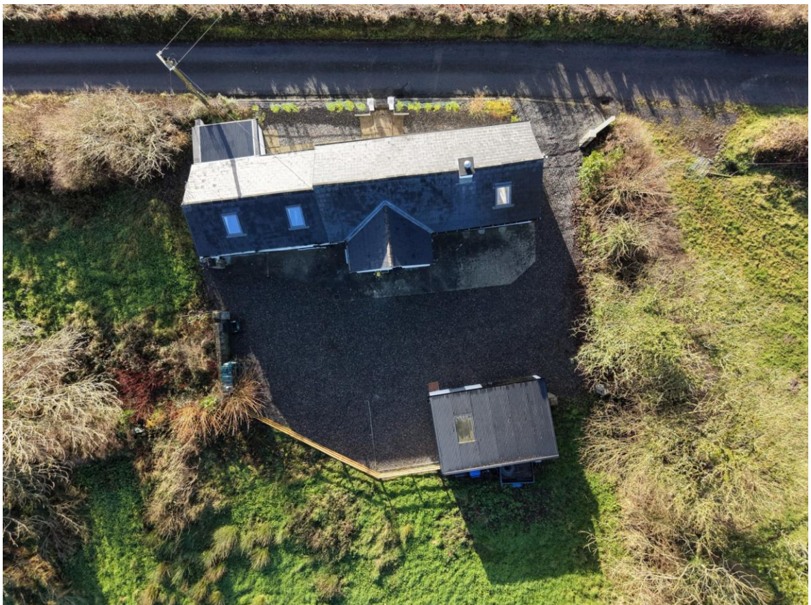
Annagh Cottage on c. 2.66 Acres, Trien, Castlerea, Co. Roscommon. F45 DP83