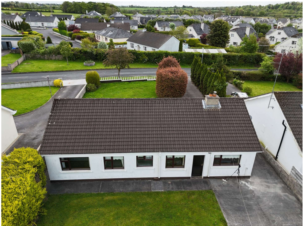
9 Hawthorn Drive, Roscommon Town. F42 V963