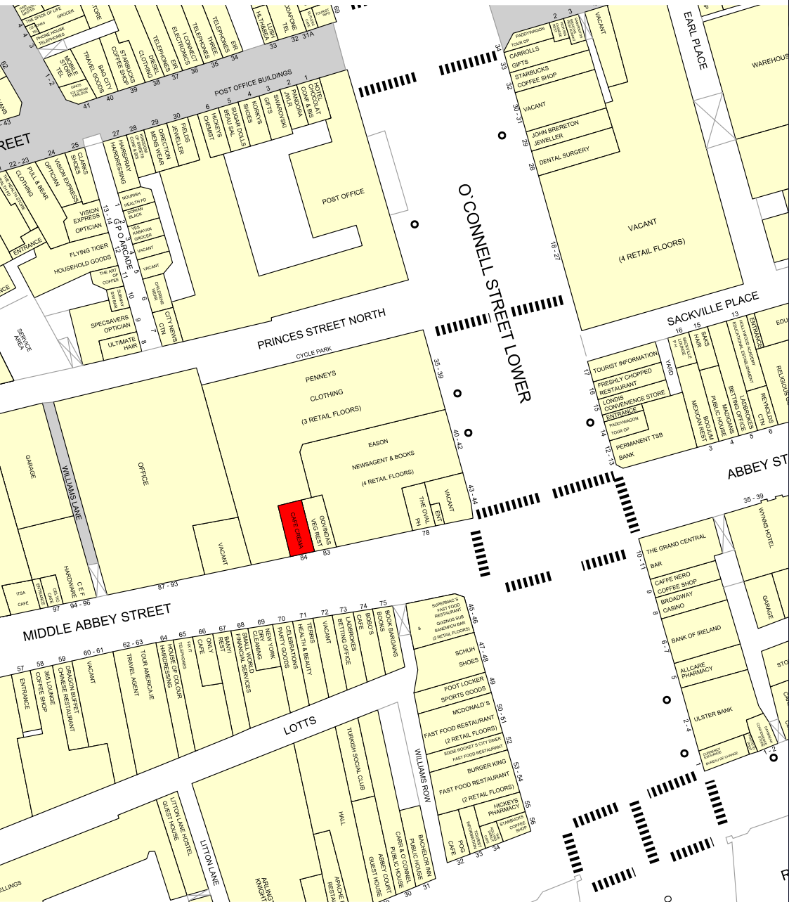
Location map – for indicative purposes only