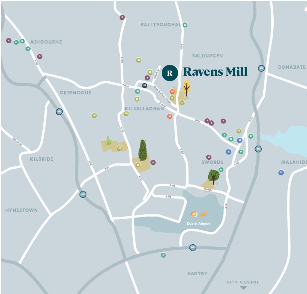
LOCATION MAP – For indicative purposes only