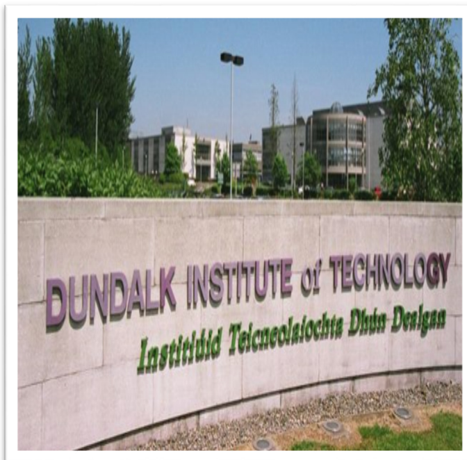
DUNDALK INSTITUTE OF TECHNOLOGY