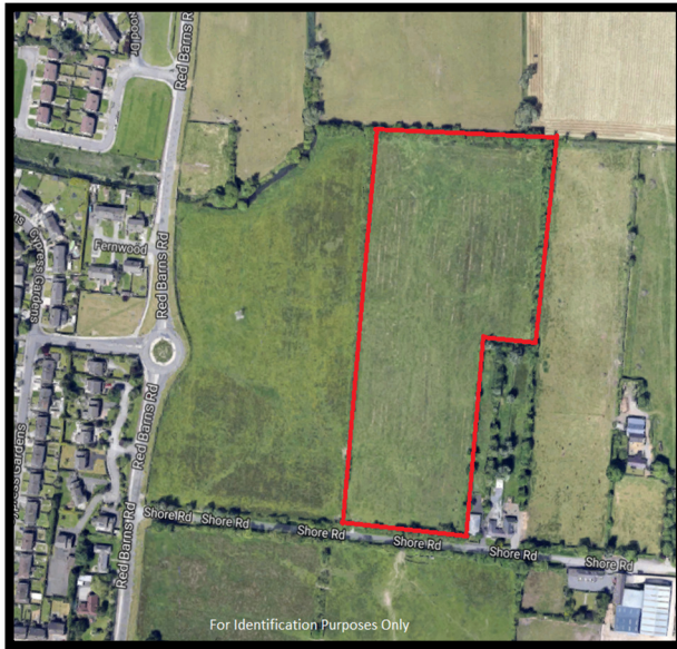
LOT 1 – c. 9.60 acres / 3.88 ha

The subject lands are located on the Shore Road, Dundalk, Co. Louth which links the Red Barns Road to the sea shore and is only a short drive from Dundalk town centre. These are good quality pasture and meadow lands in a tranquil scenic setting with substantial road frontage and are suited to a variety of agricultural and recreational uses. The property is being sold in three separate lots as follows: