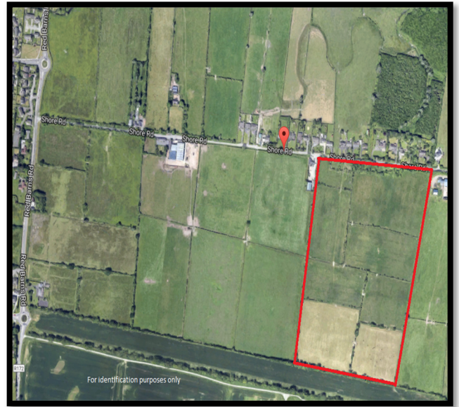
LOT 2 – c.38.27 acres / 15.49 ha