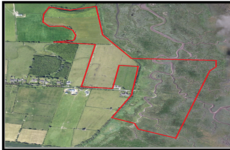
LOT 3 – c.26.73 acres / 10.82 ha

Together with saltings of c.64.93 acres / 26.82 ha