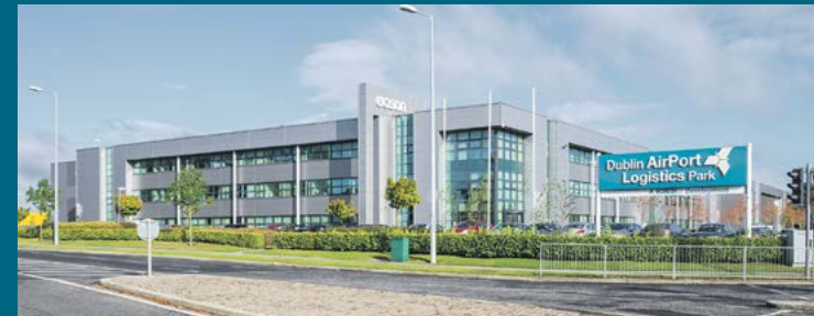
Dublin Airport Logistics Park