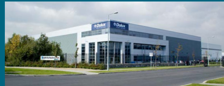
South City Business Park