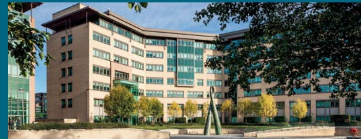
Grand Canal Plaza