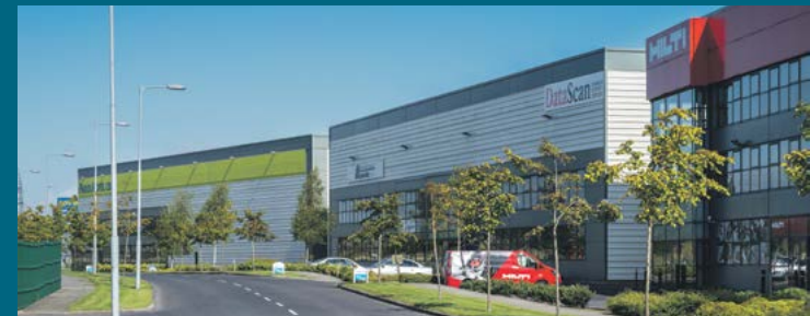
North City Business Park