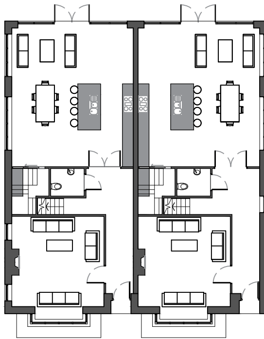
GROUND FLOOR TYPE A