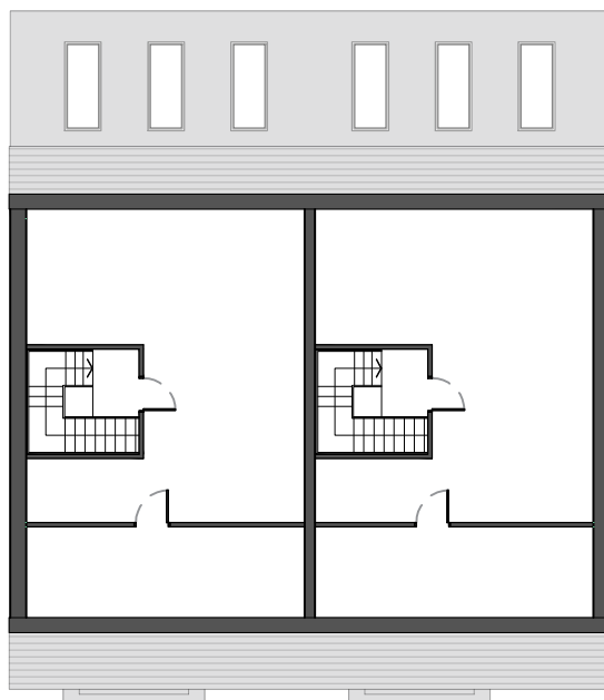
SECOND FLOOR TYPE A