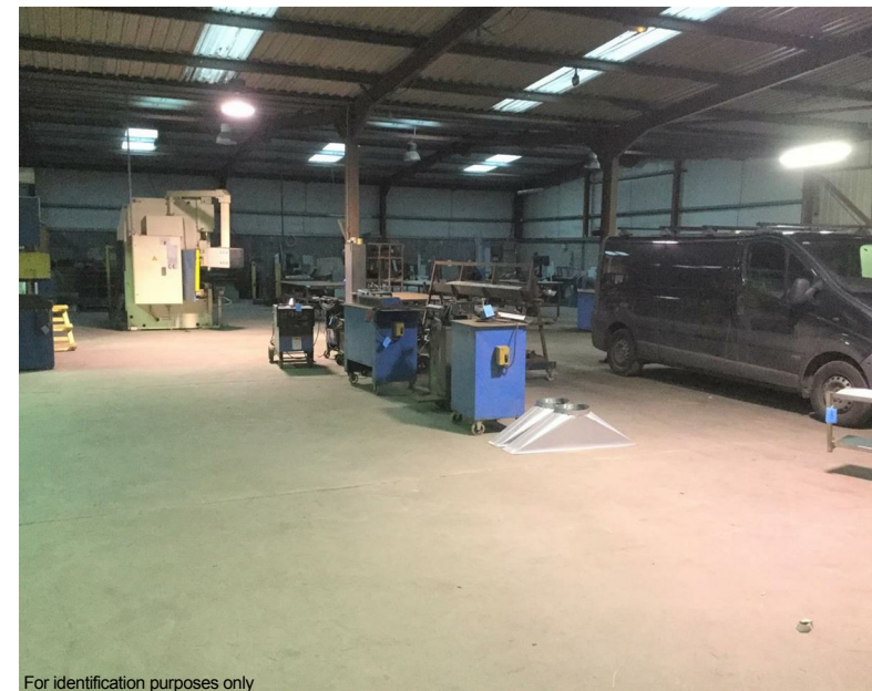
For identification purposes only