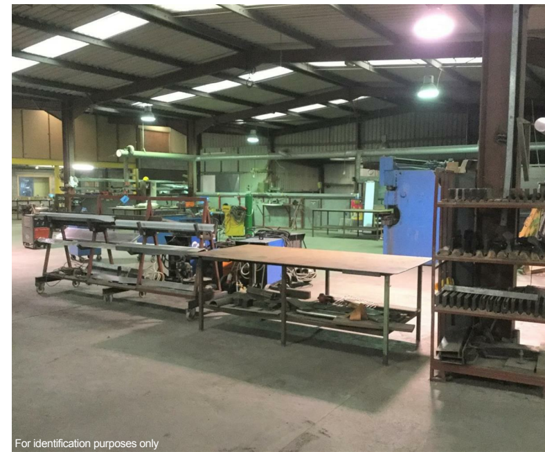
For identification purposes only