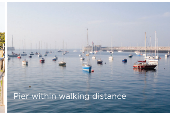
Pier within walking distance