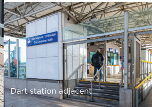
Dart station adjacent