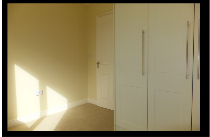
Bedroom 3 (Master En