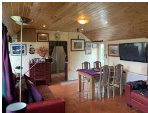
Large Living Room/Dining Room with Stove & wood ceiling