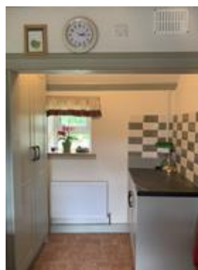
Newly Fitted & Tiled Kitchen