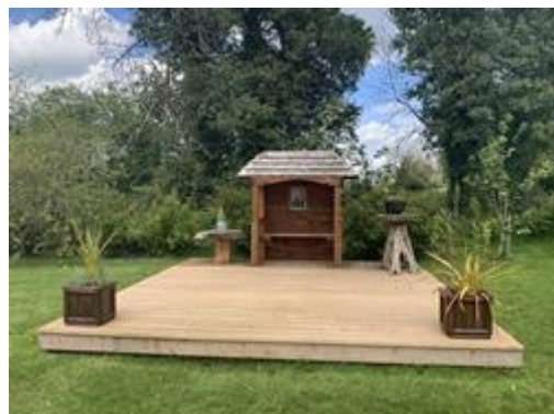
Hand crafted gazebo & decking