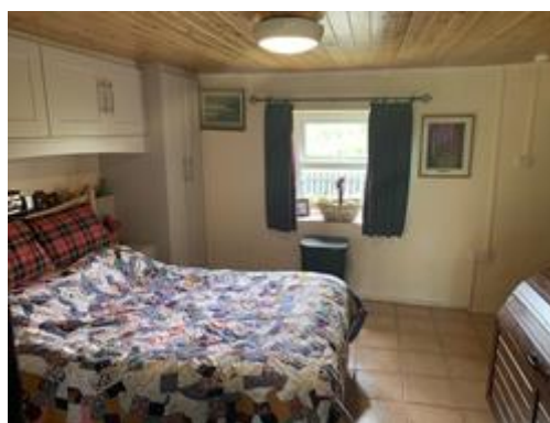
Bedroom with fitted wardrobes