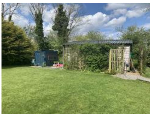
Large Purpose built shed with electricity & plumbing laid on