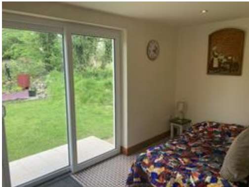
Large Bedroom with patio door leading to rear garden