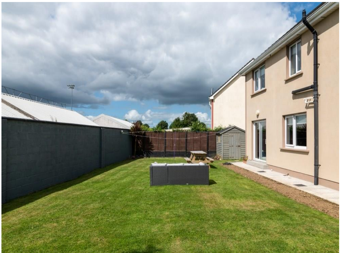
9 Claremont, Ballyforan, Co. Roscommon. H53 HN92