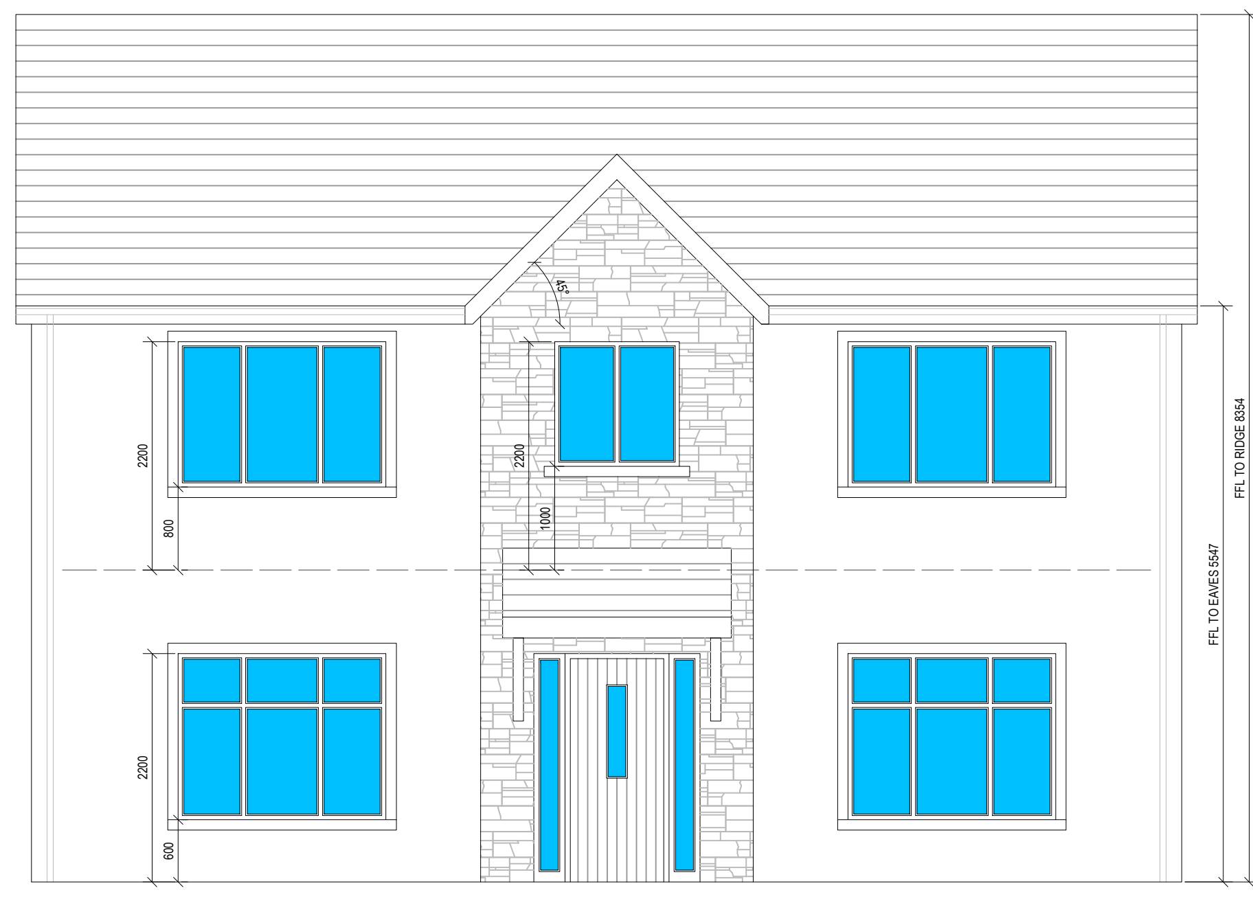
1.04 SIDE ELEVATION 24/181-503 / 1:50 (on A1)