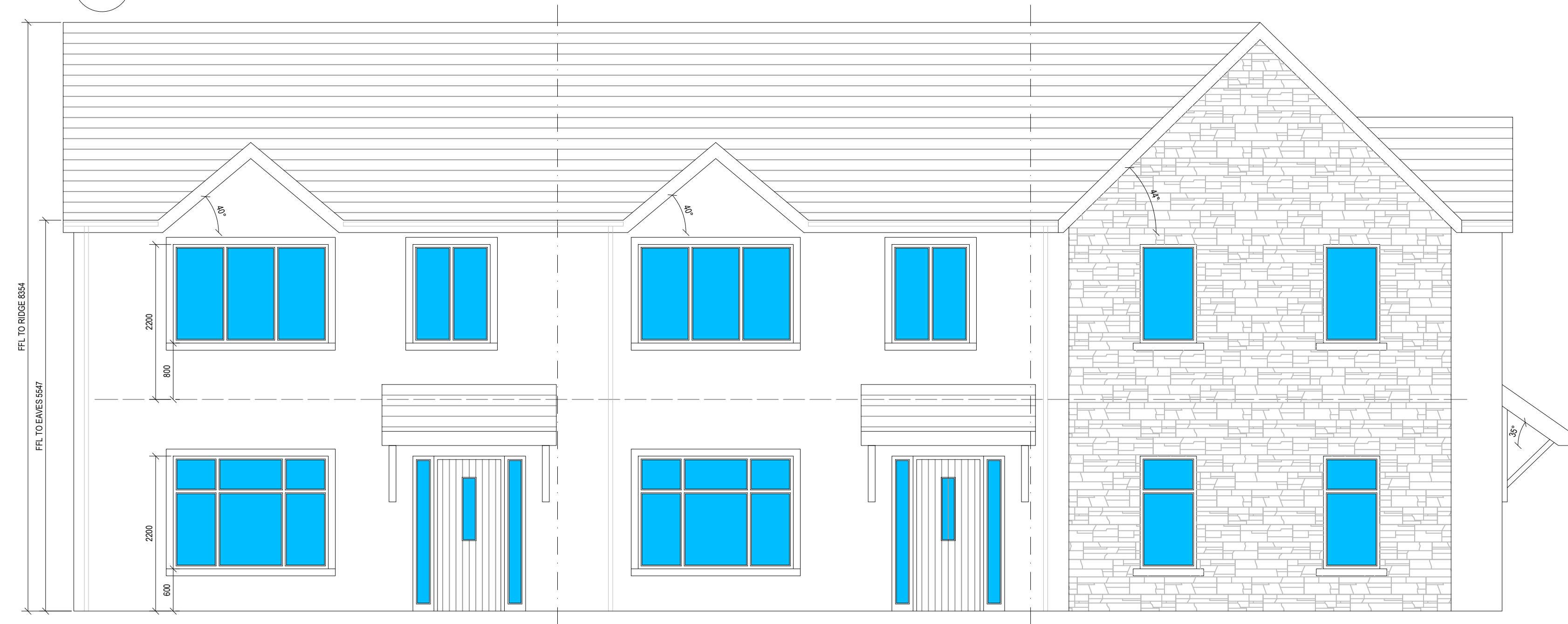
1.03 FRONT ELEVATION 24/181-503 / 1:50 (on A1)