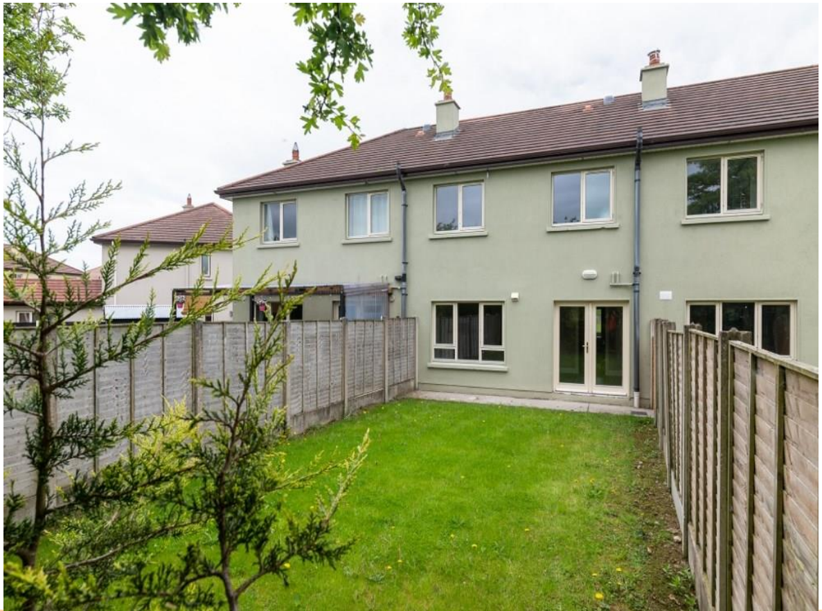
142 Abbeyville, Galway Road, Roscommon Town. F42 NX78