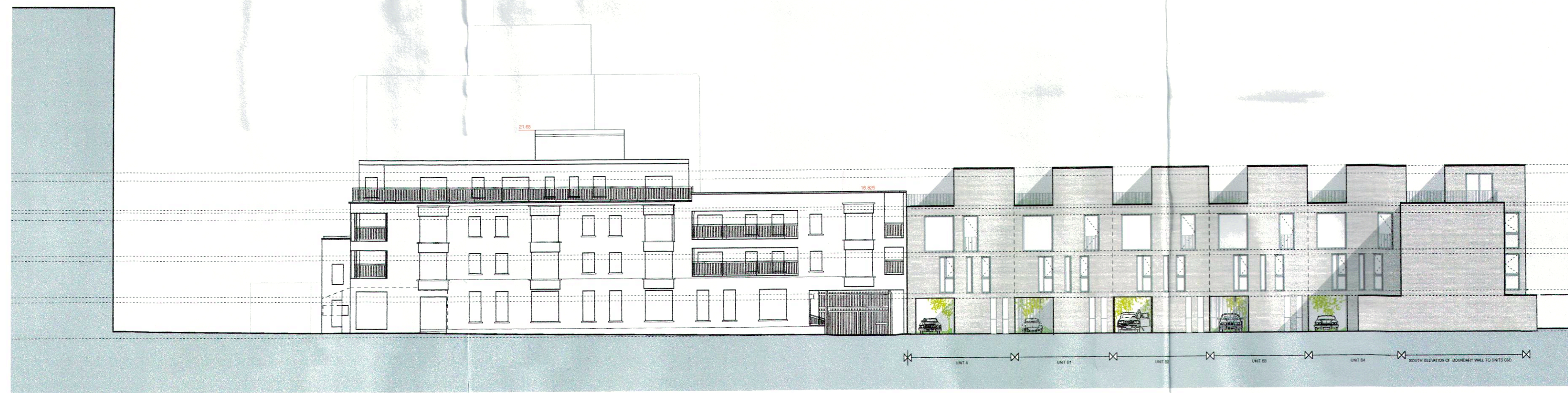
ELEVATION F:F VIEW FROM GRATTAN COURT EAST - SCALE: 1:250@A1