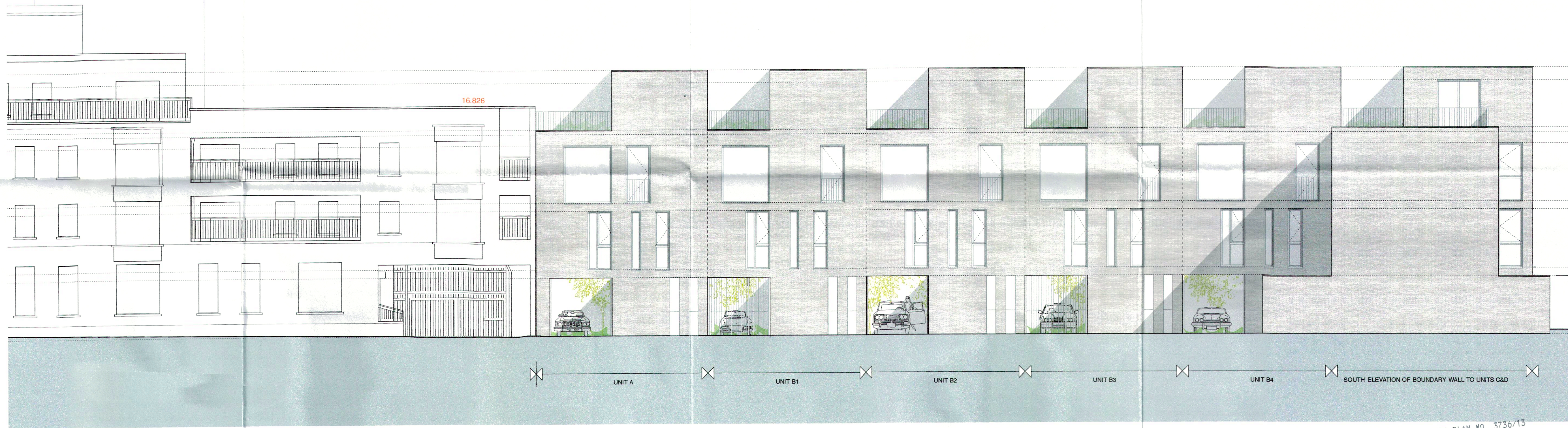
ELEVATION F:F VIEW FROM GRATTAN COURT EAST - SCALE: 1:100@A1