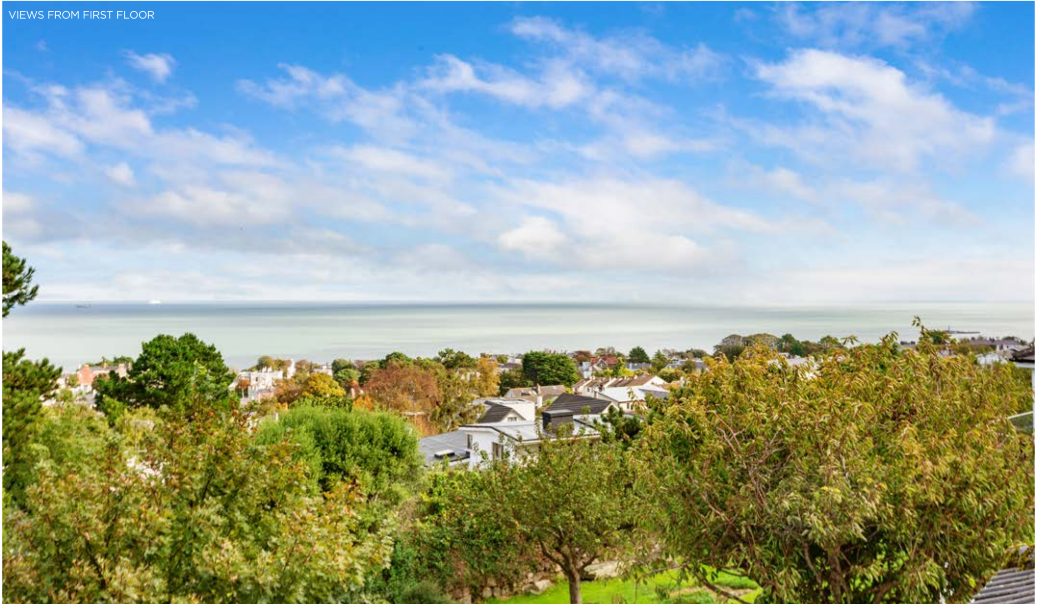
VIEWS FROM FIRST FLOOR