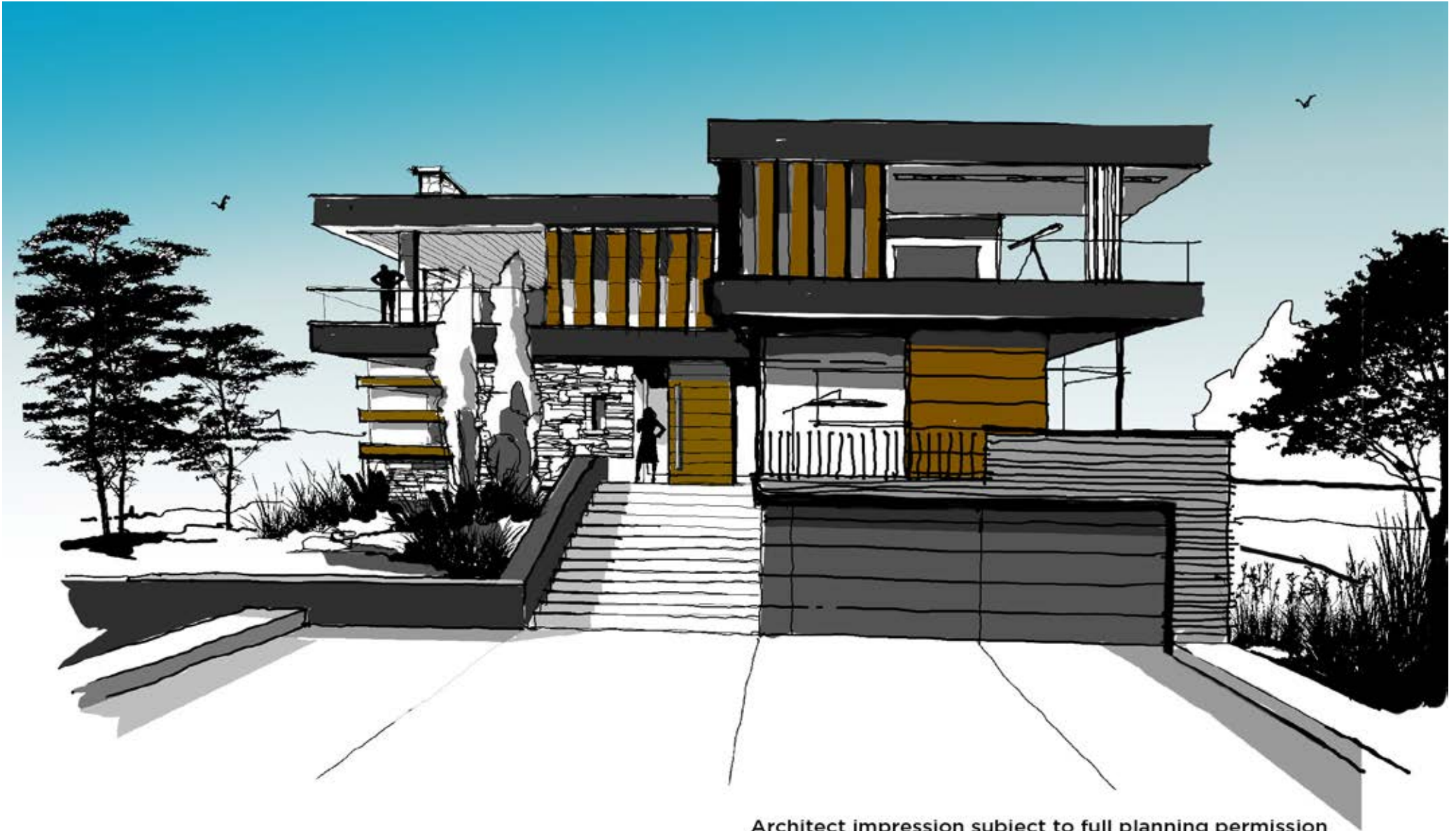
Architect impression subject to full planning permission