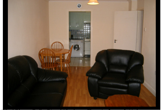
Tiled Floor. Fully Fitted Kitchen. Electric Oven & Hob. Plumbed For Washing Machine.