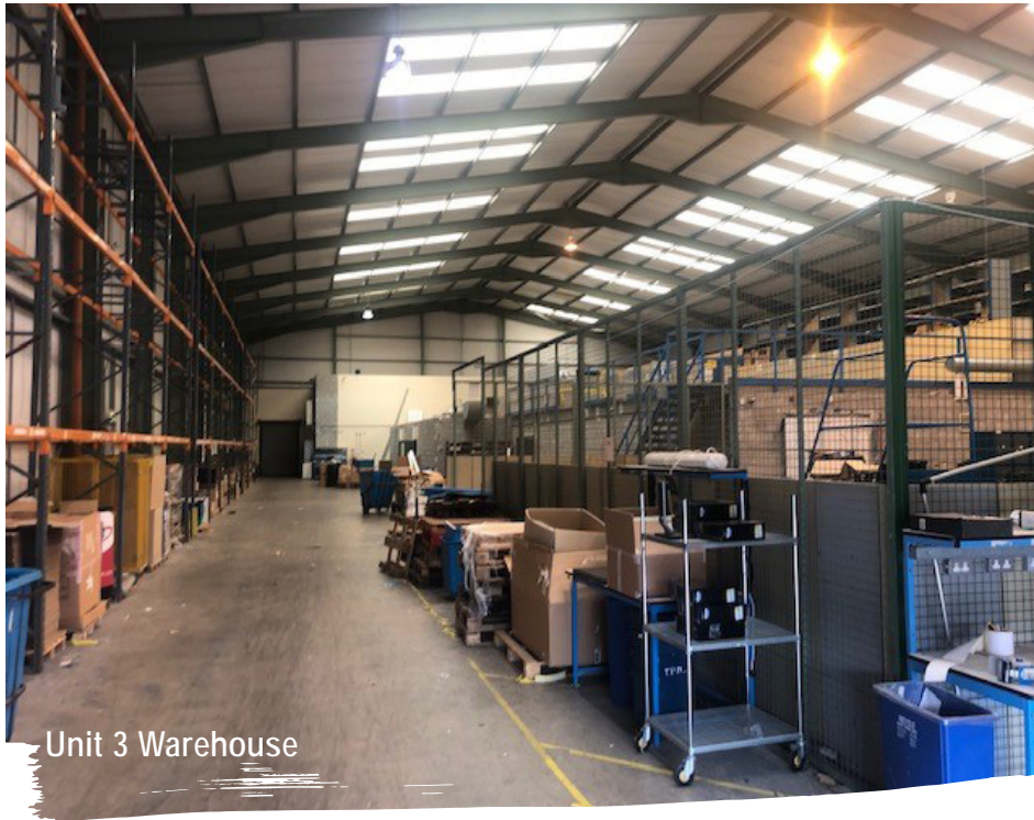
Unit 3 Warehouse