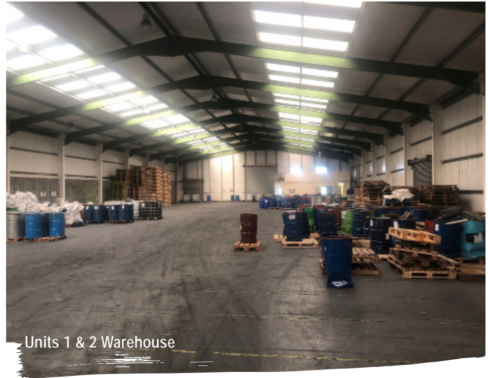
Units 1 & 2 Warehouse