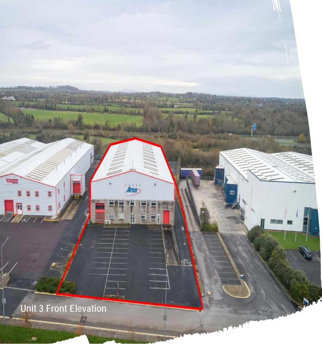
Unit 3 Front Elevation