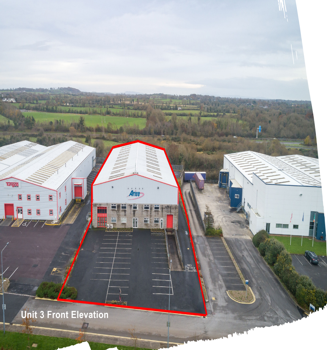
Unit 3 Front Elevation