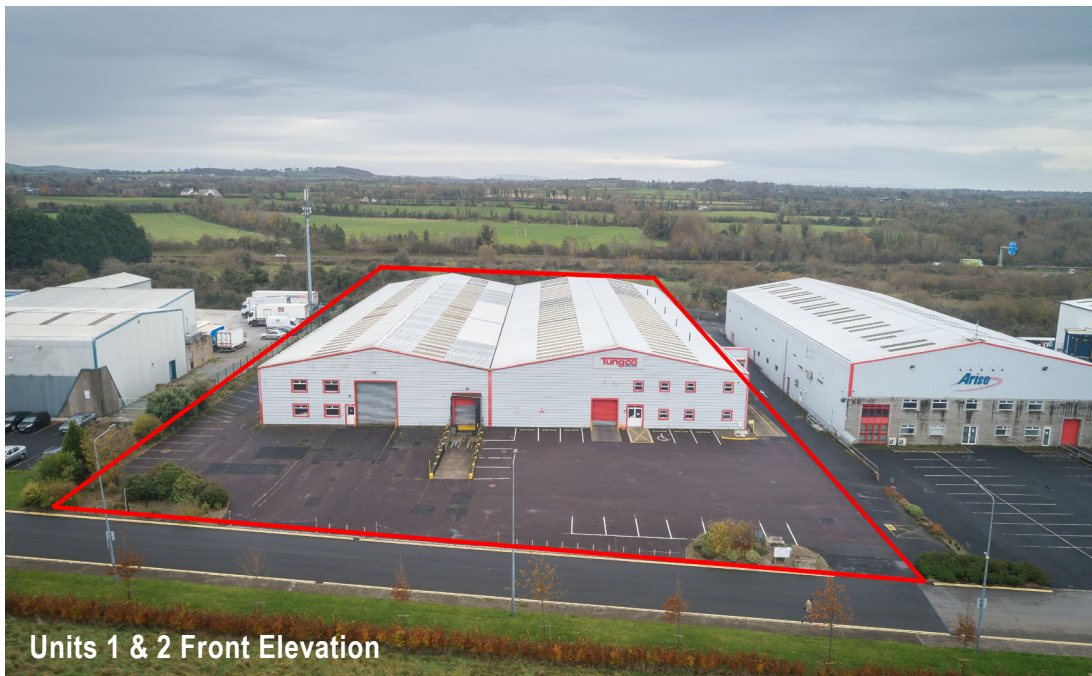
Units 1 & 2 Front Elevation