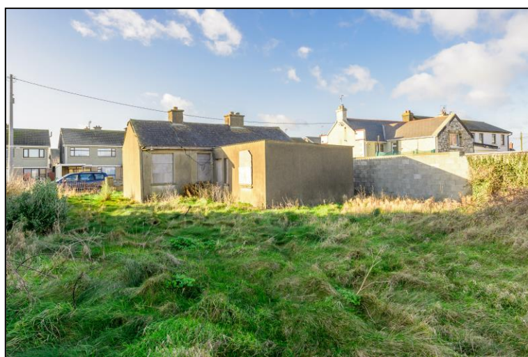
Rear of existing building