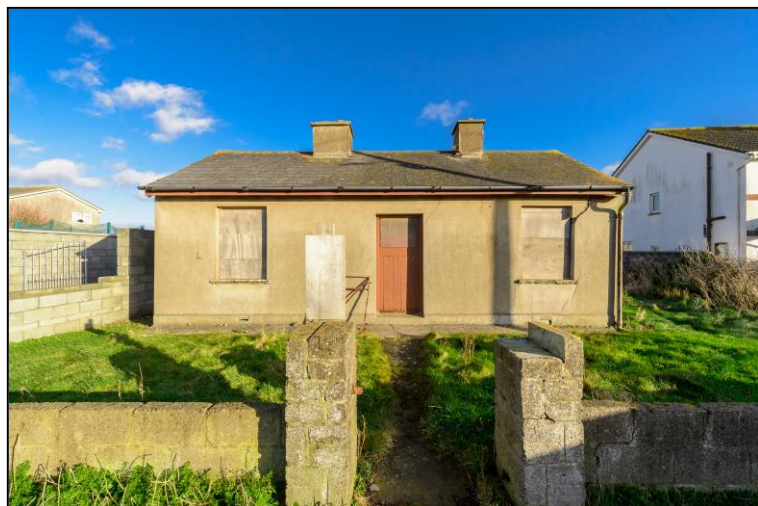
Existing uninhabitable building