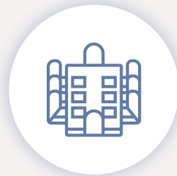
MEETING & BOARD ROOMS