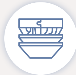
RAISED ACCESS FLOORS