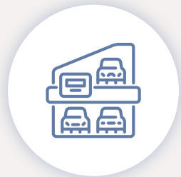
SECURE BASEMENT CAR PARKING