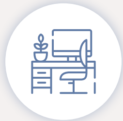
FULLY FITTED & FURNISHED