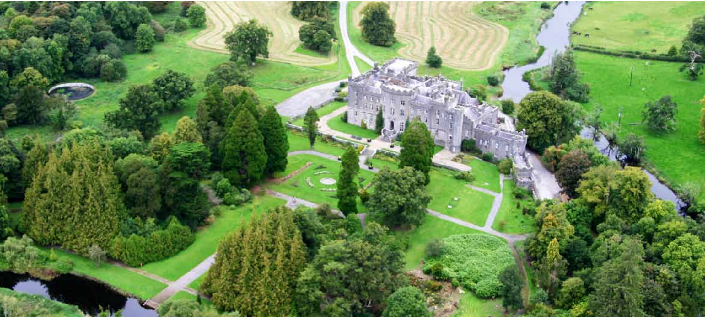
Markree Castle Collooney, Co.sligo