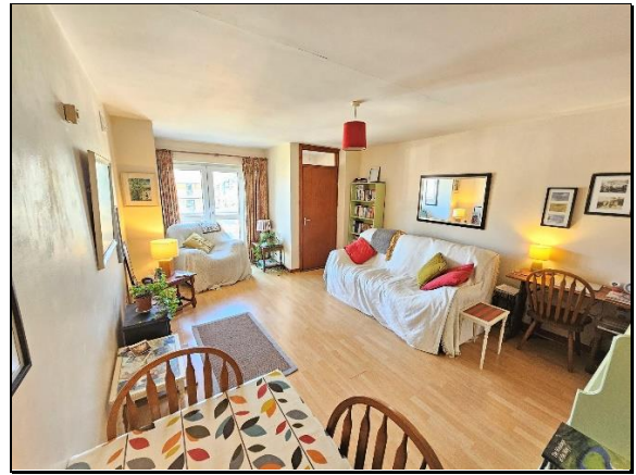
Living / Dining Room