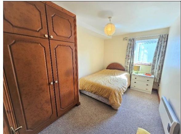
Bedroom No. 1