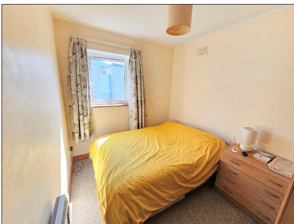
Bedroom No. 2