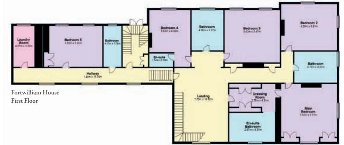
Fortwilliam House First Floor

Approximate Gross Internal Floor Area: Fortwilliam House - 949 sq m (10,215 sq ft) Fisherman's Cottage - 160 sq m (1,725 sq ft) For identification only, not to scale.