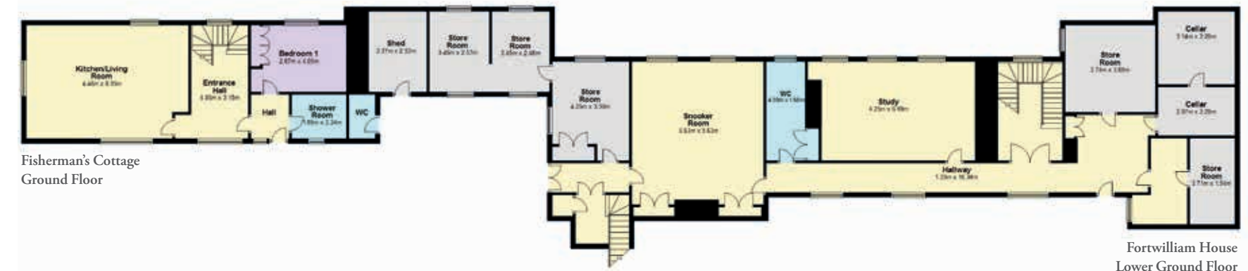
Fisherman's Cottage Ground Floor