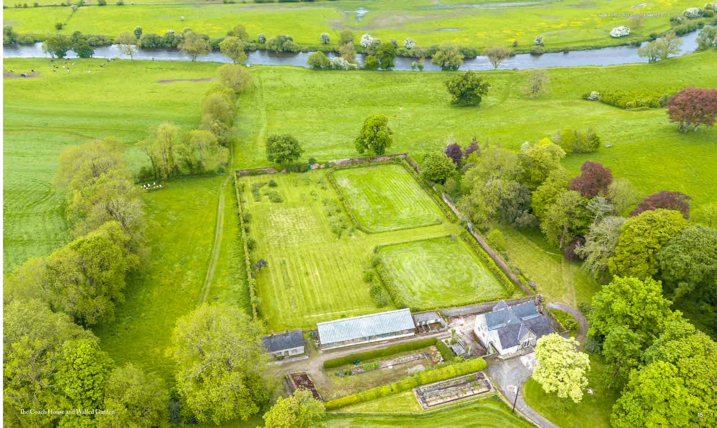
The Coach House and Walled Garden