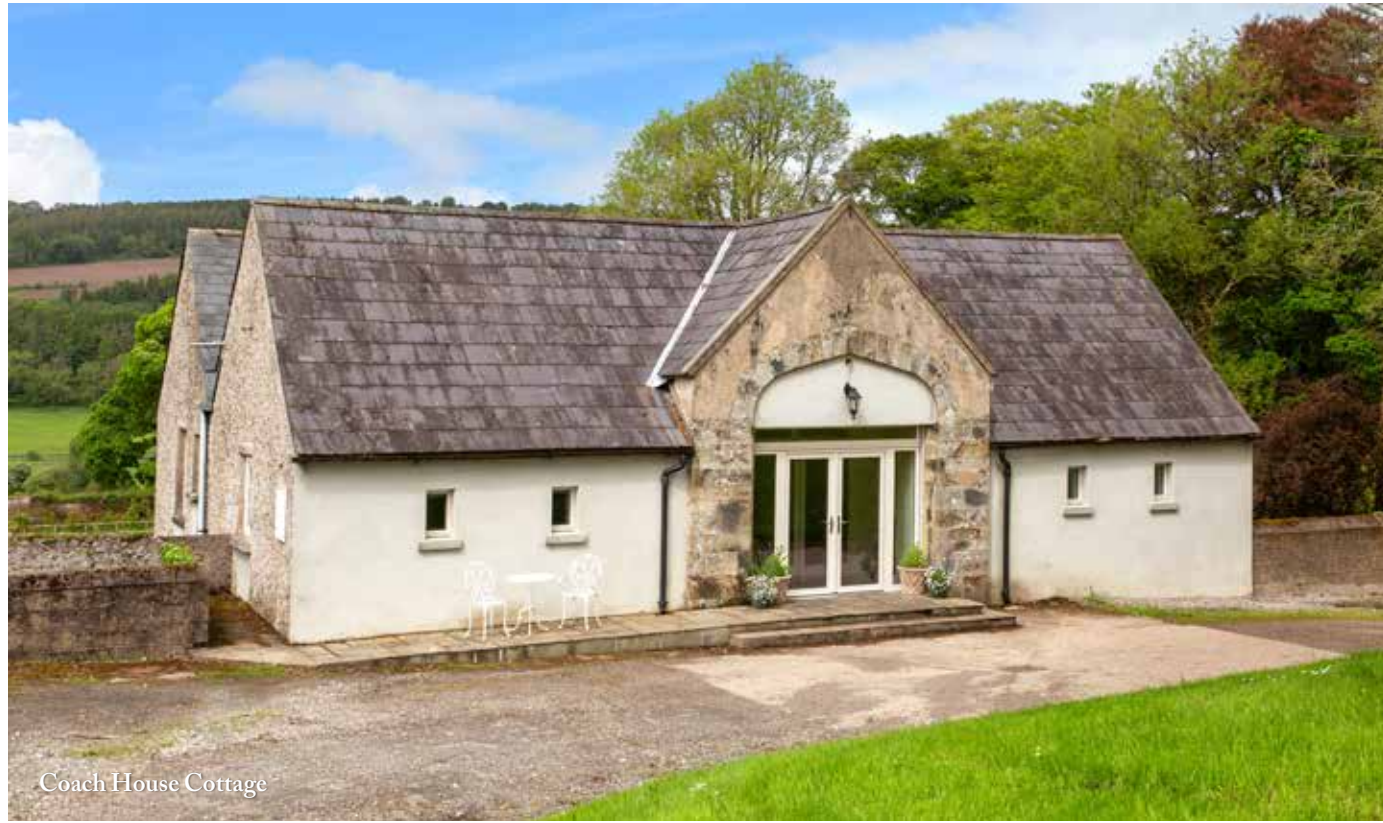
Coach House Cottage