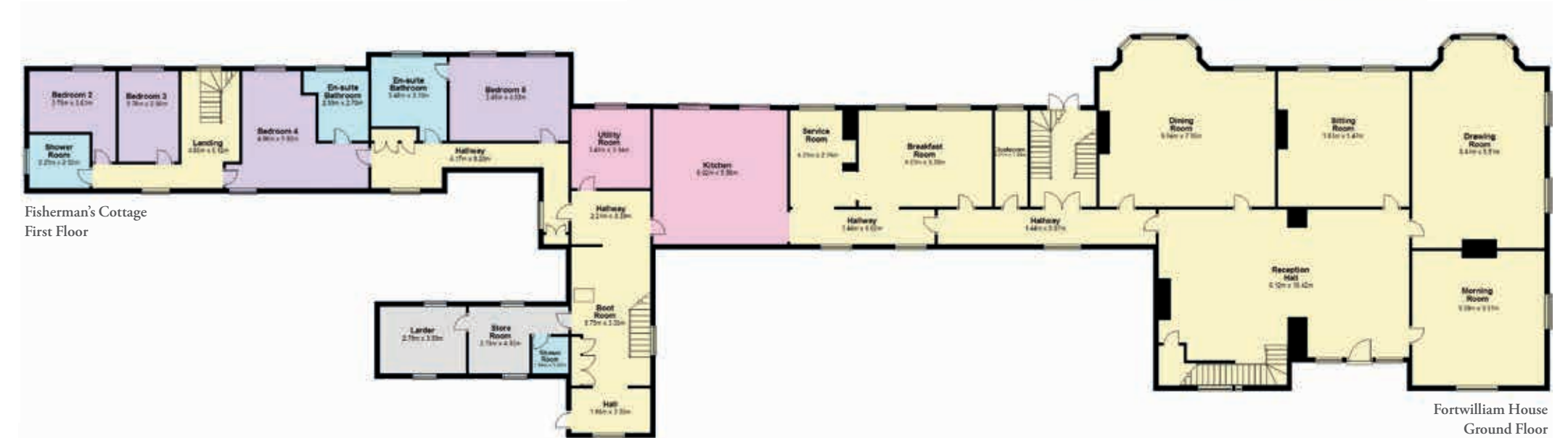
Fisherman's Cottage First Floor