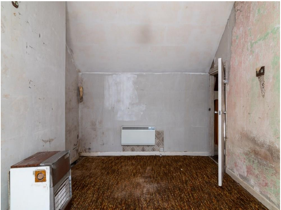
Residence On C. 15.4 Acres At, Ardoslough, Glenamaddy, F45 DW68