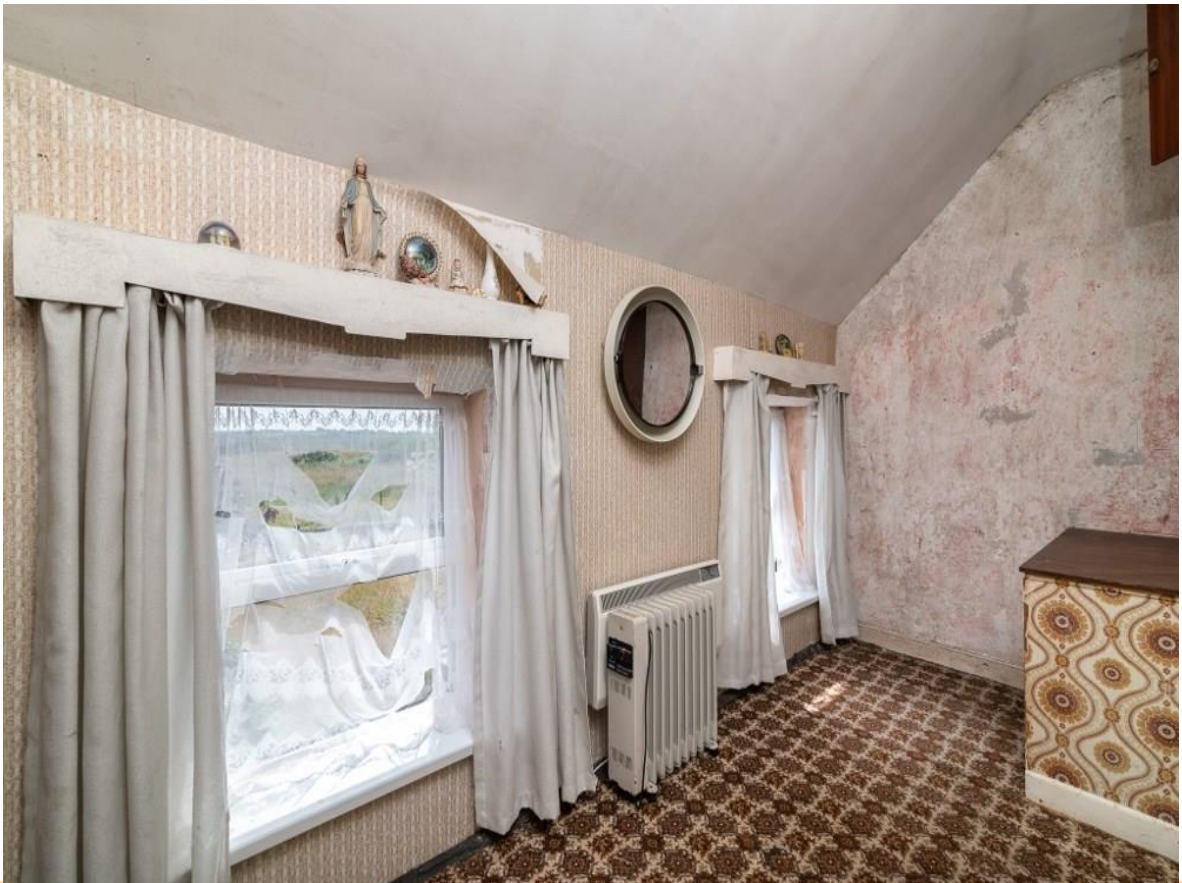
Residence On C. 15.4 Acres At, Ardoslough, Glenamaddy, F45 DW68