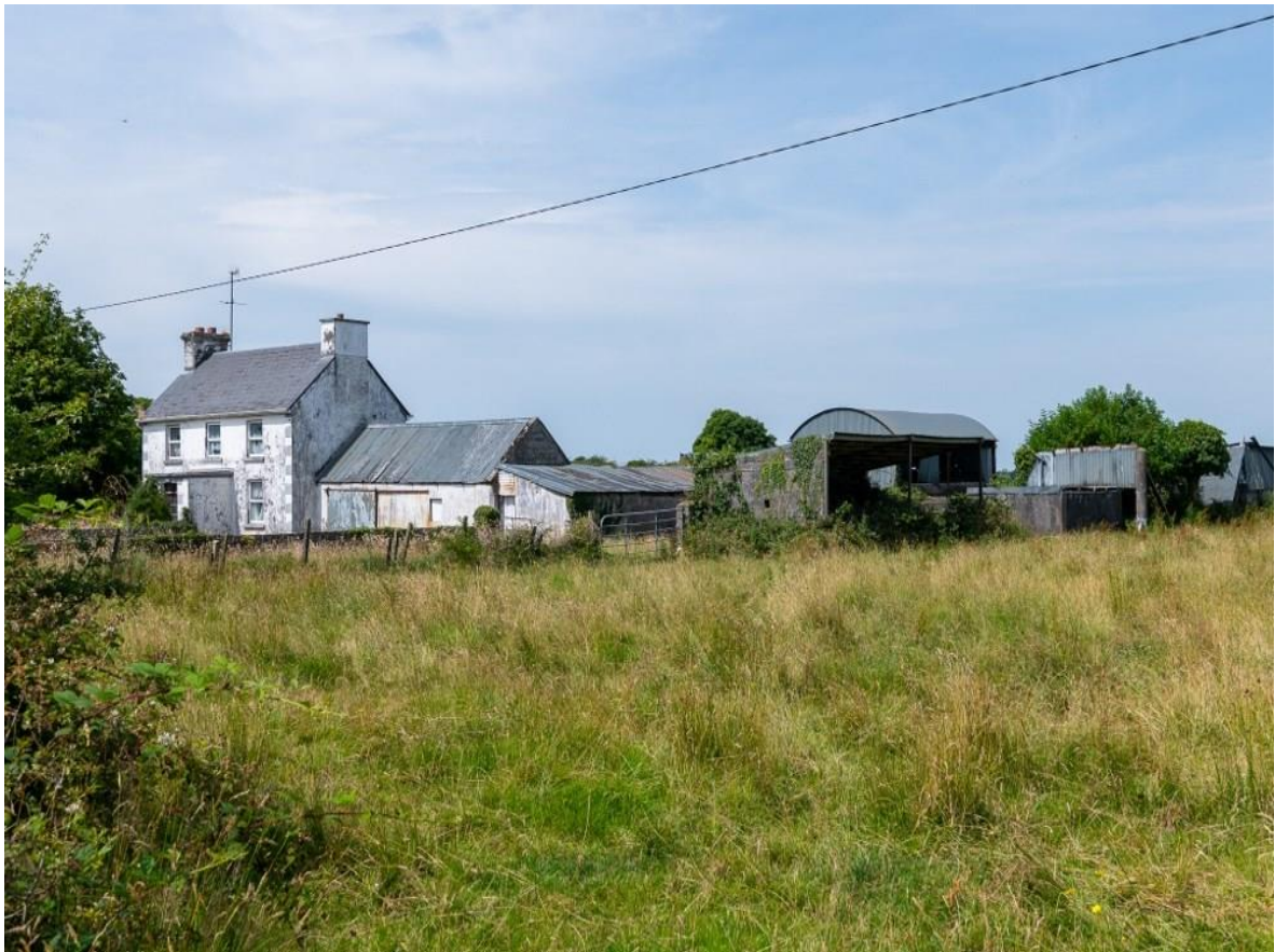
Residence On C. 15.4 Acres At, Ardoslough, Glenamaddy, F45 DW68