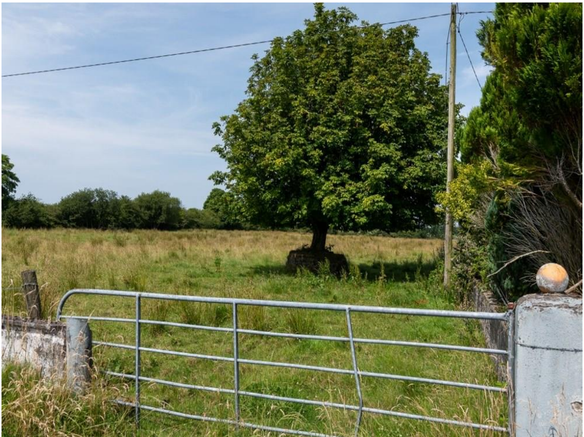
Residence On C. 15.4 Acres At, Ardoslough, Glenamaddy, F45 DW68