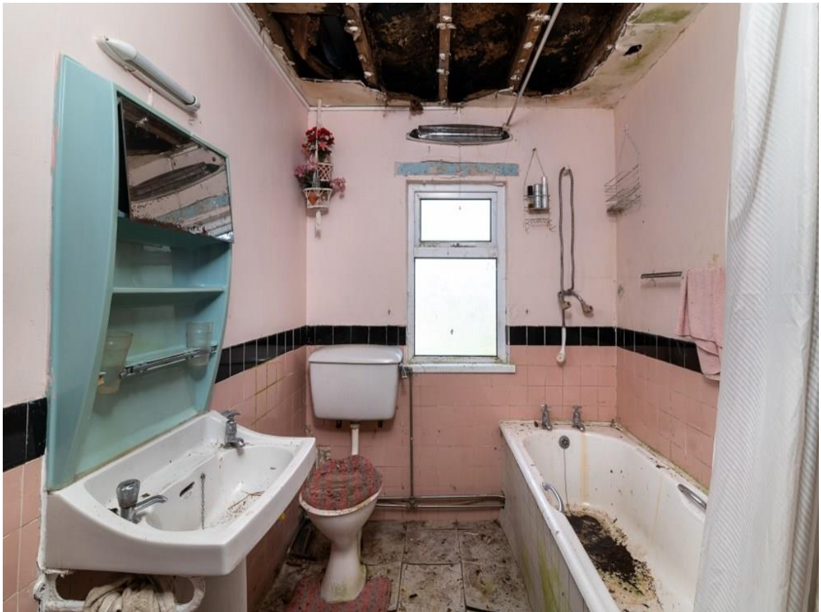
Residence On C. 15.4 Acres At, Ardoslough, Glenamaddy, F45 DW68