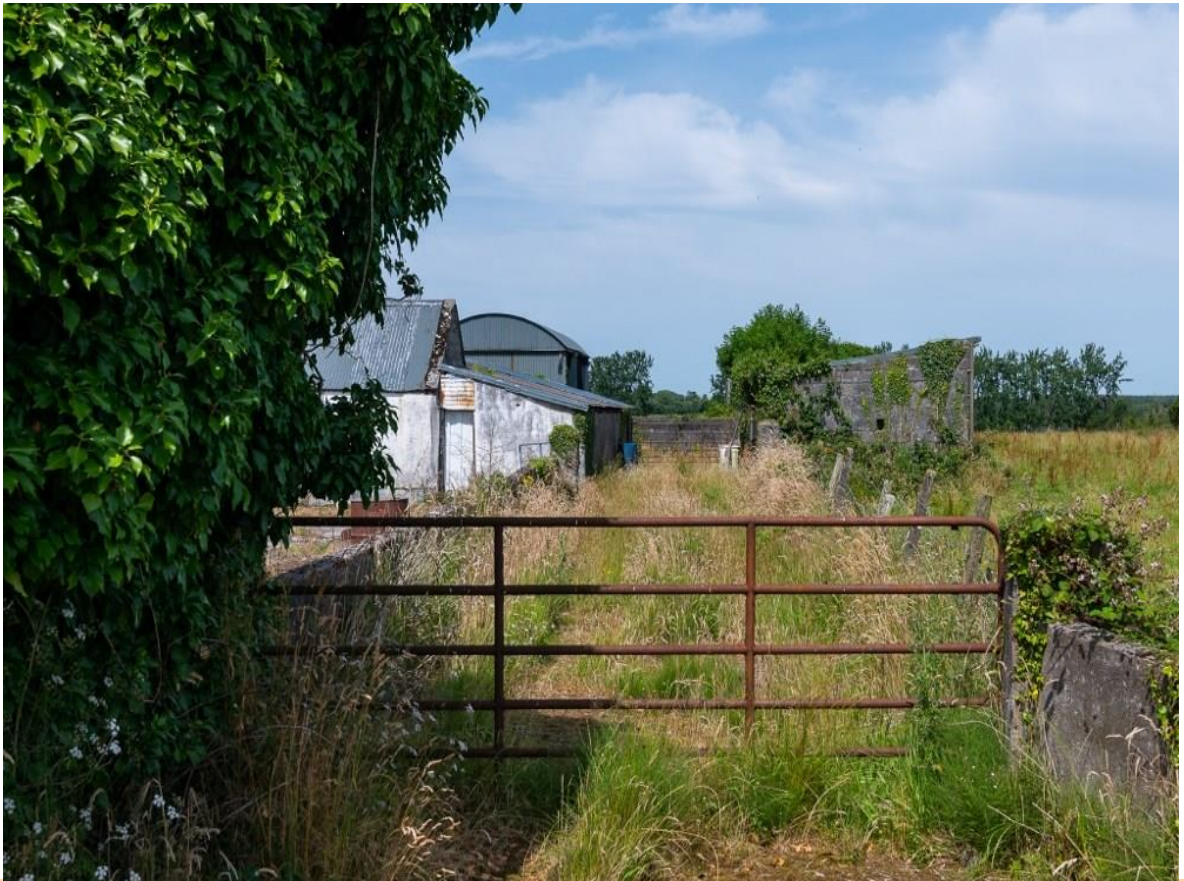
Residence On C. 15.4 Acres At, Ardoslough, Glenamaddy, F45 DW68