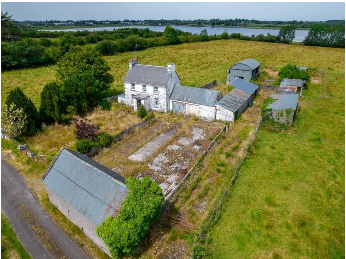
Residence On C. 15.4 Acres At, Ardoslough, Glenamaddy, F45 DW68