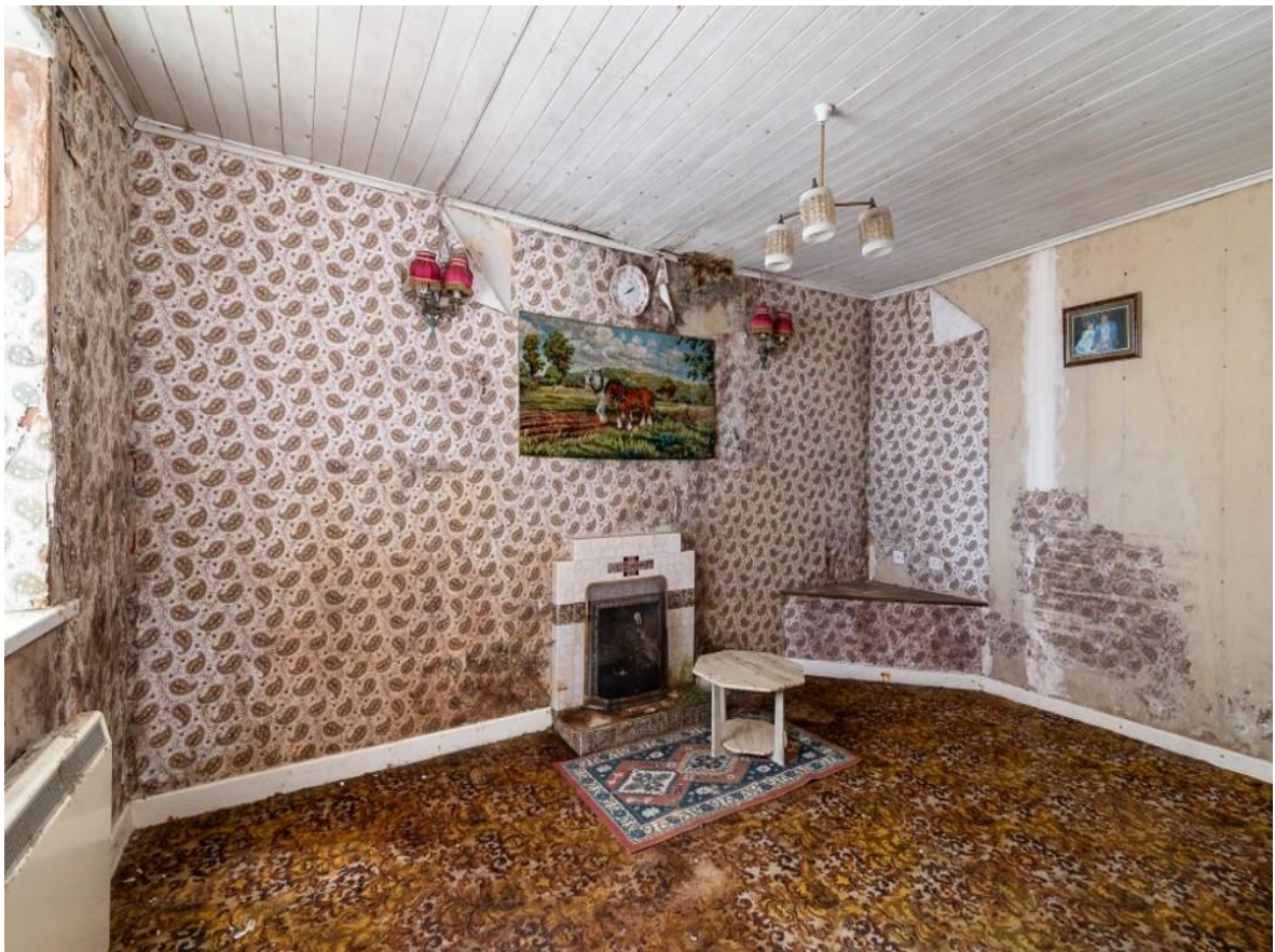
Residence On C. 15.4 Acres At, Ardoslough, Glenamaddy, F45 DW68