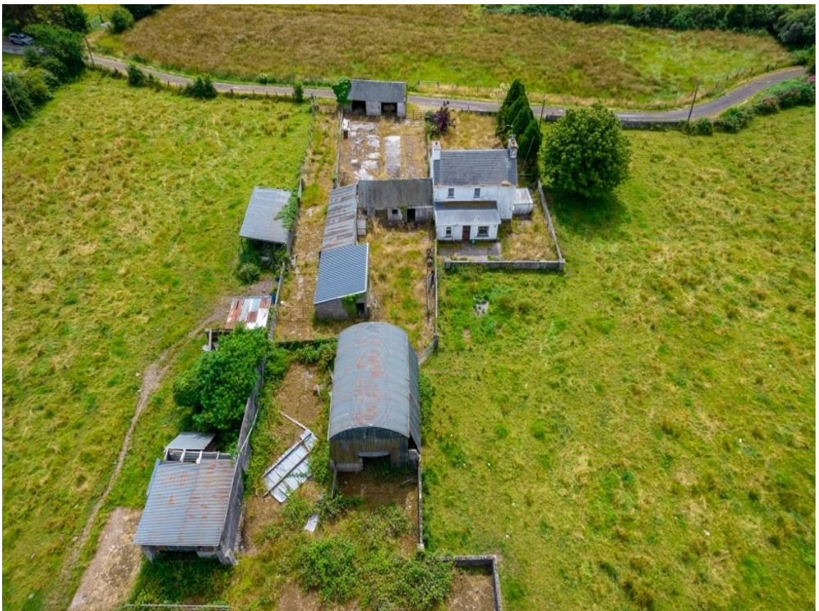
Residence On C. 15.4 Acres At, Ardoslough, Glenamaddy, F45 DW68