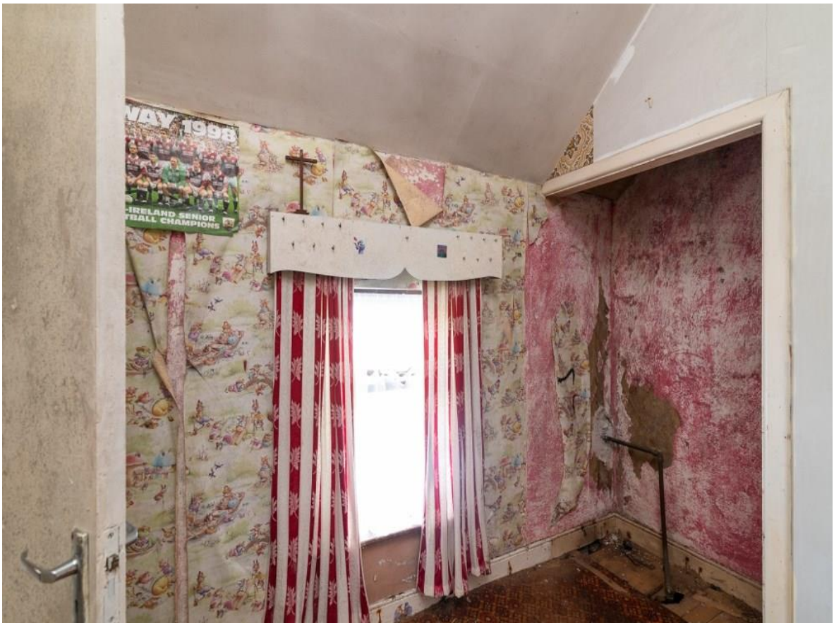
Residence On C. 15.4 Acres At, Ardoslough, Glenamaddy, F45 DW68