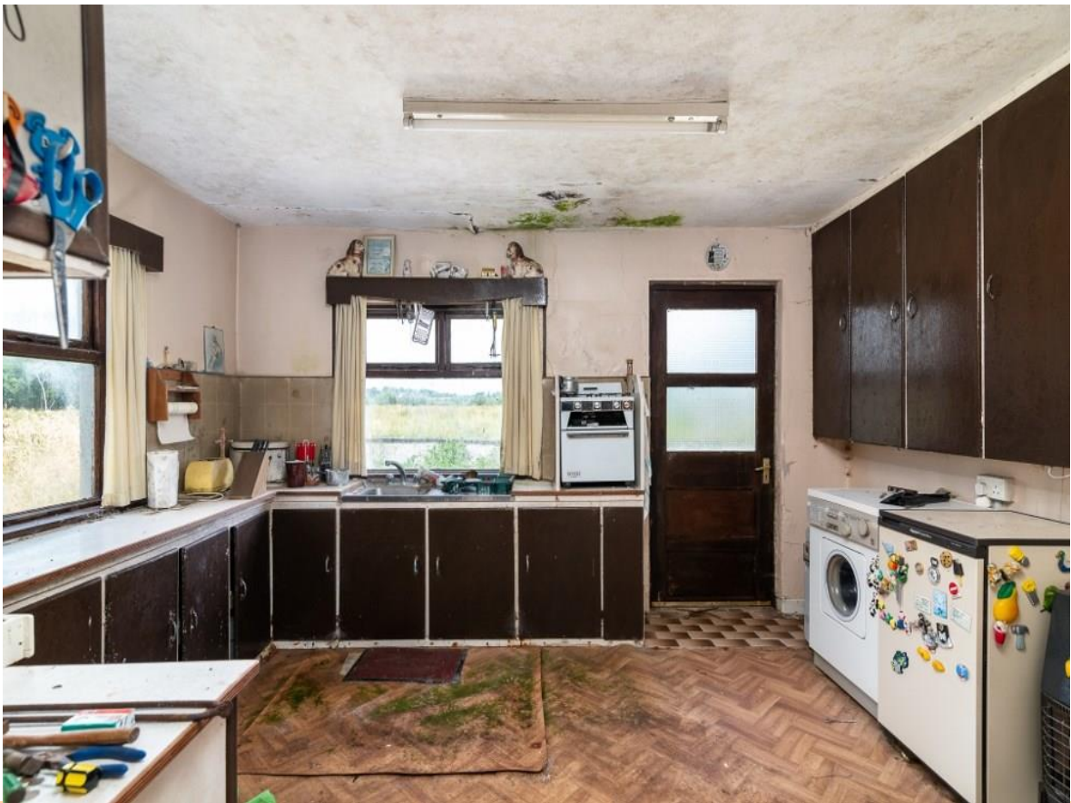
Residence On C. 15.4 Acres At, Ardoslough, Glenamaddy, F45 DW68