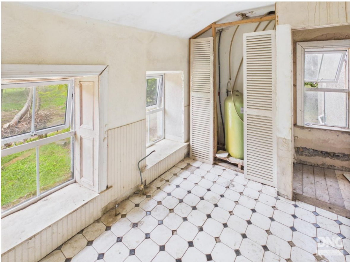
'Frenchlawn House' on c. 85.30 Acres, Frenchlawn, Ballintober, Co. Roscommon. F45 A021