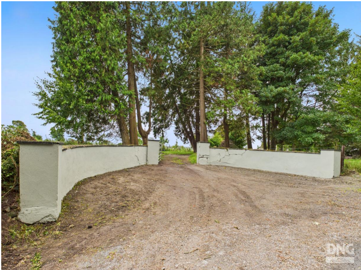
'Frenchlawn House' on c. 85.30 Acres, Frenchlawn, Ballintober, Co. Roscommon. F45 A021