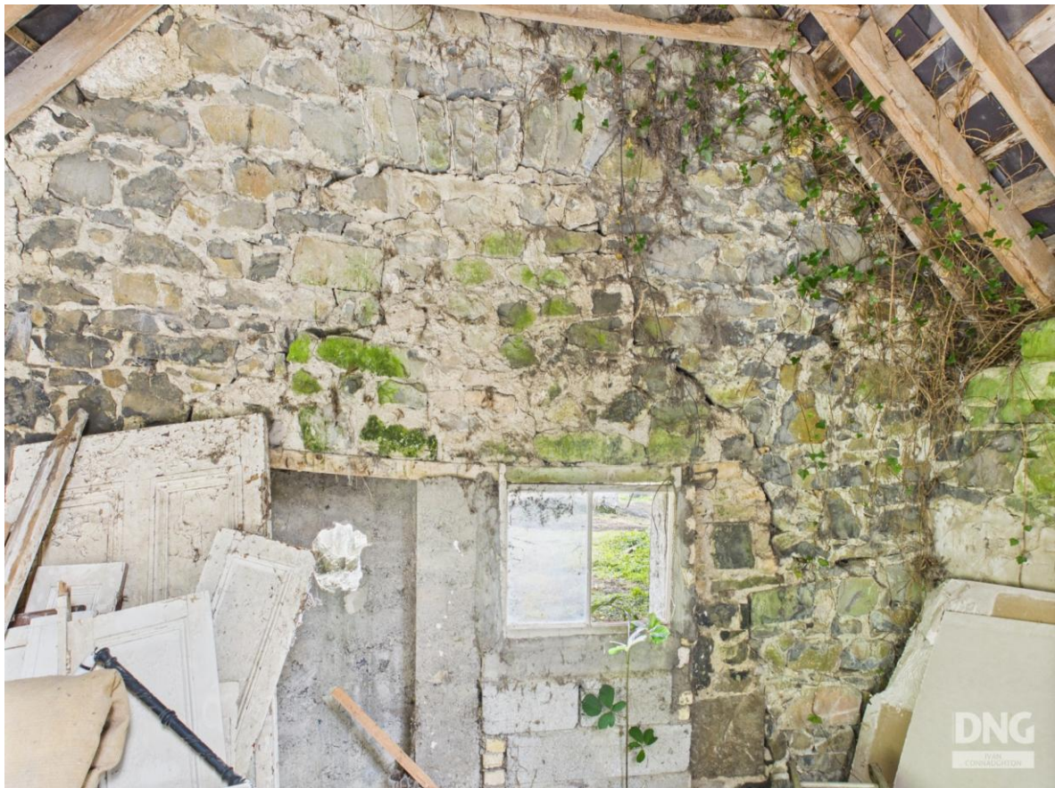
'Frenchlawn House' on c. 85.30 Acres, Frenchlawn, Ballintober, Co. Roscommon. F45 A021