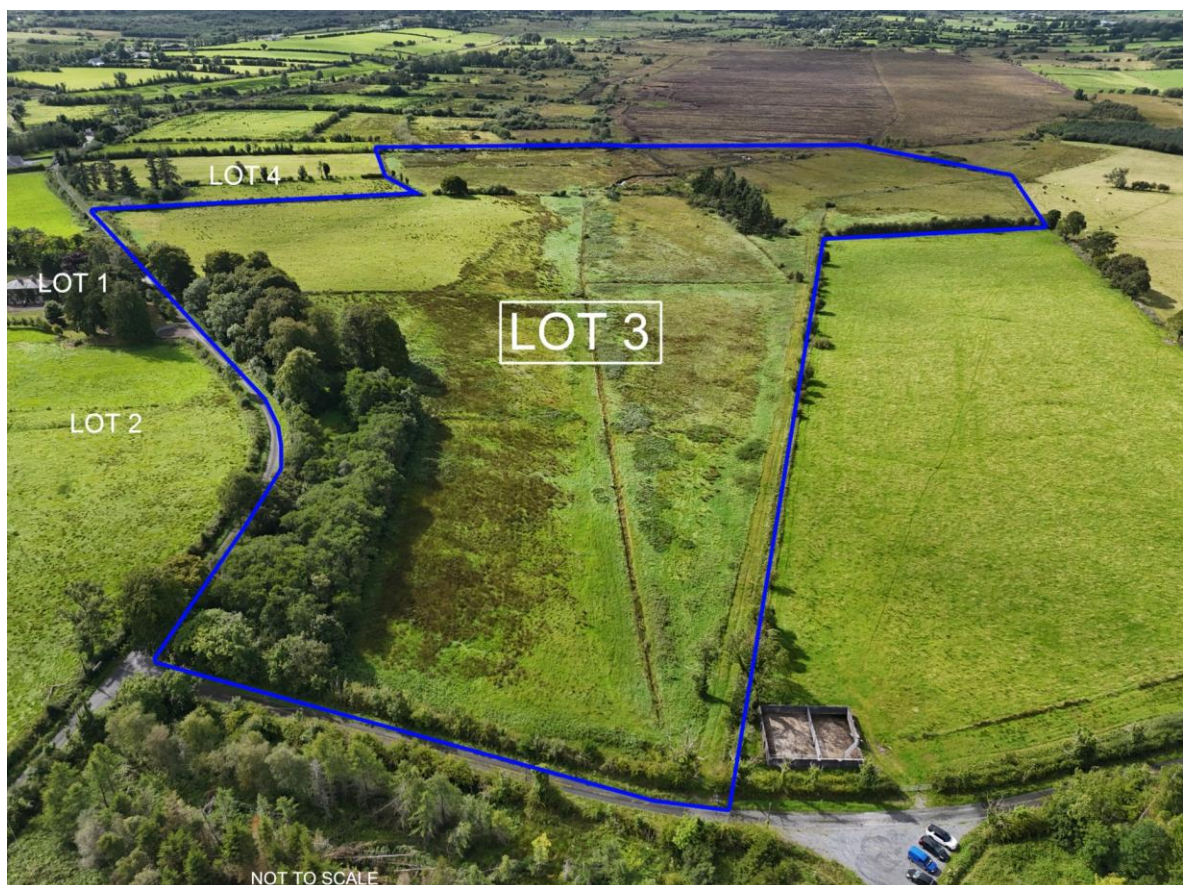
'Frenchlawn House' on c. 85.30 Acres, Frenchlawn, Ballintober, Co. Roscommon. F45 A021