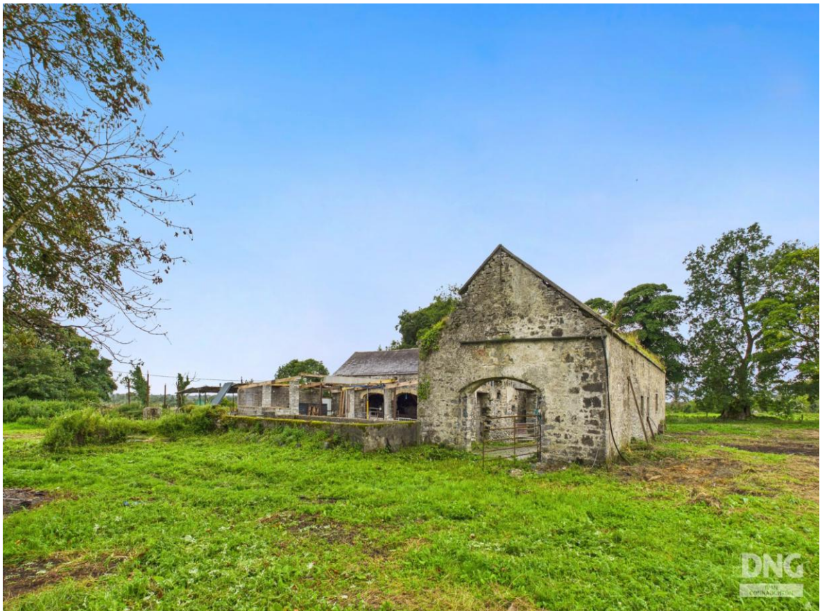
'Frenchlawn House' on c. 85.30 Acres, Frenchlawn, Ballintober, Co. Roscommon. F45 A021