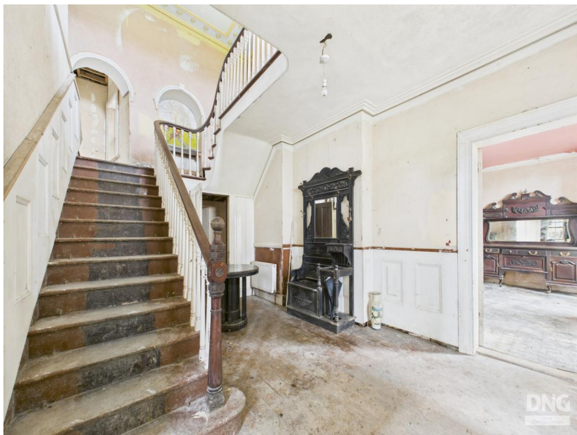
'Frenchlawn House' on c. 85.30 Acres, Frenchlawn, Ballintober, Co. Roscommon. F45 A021