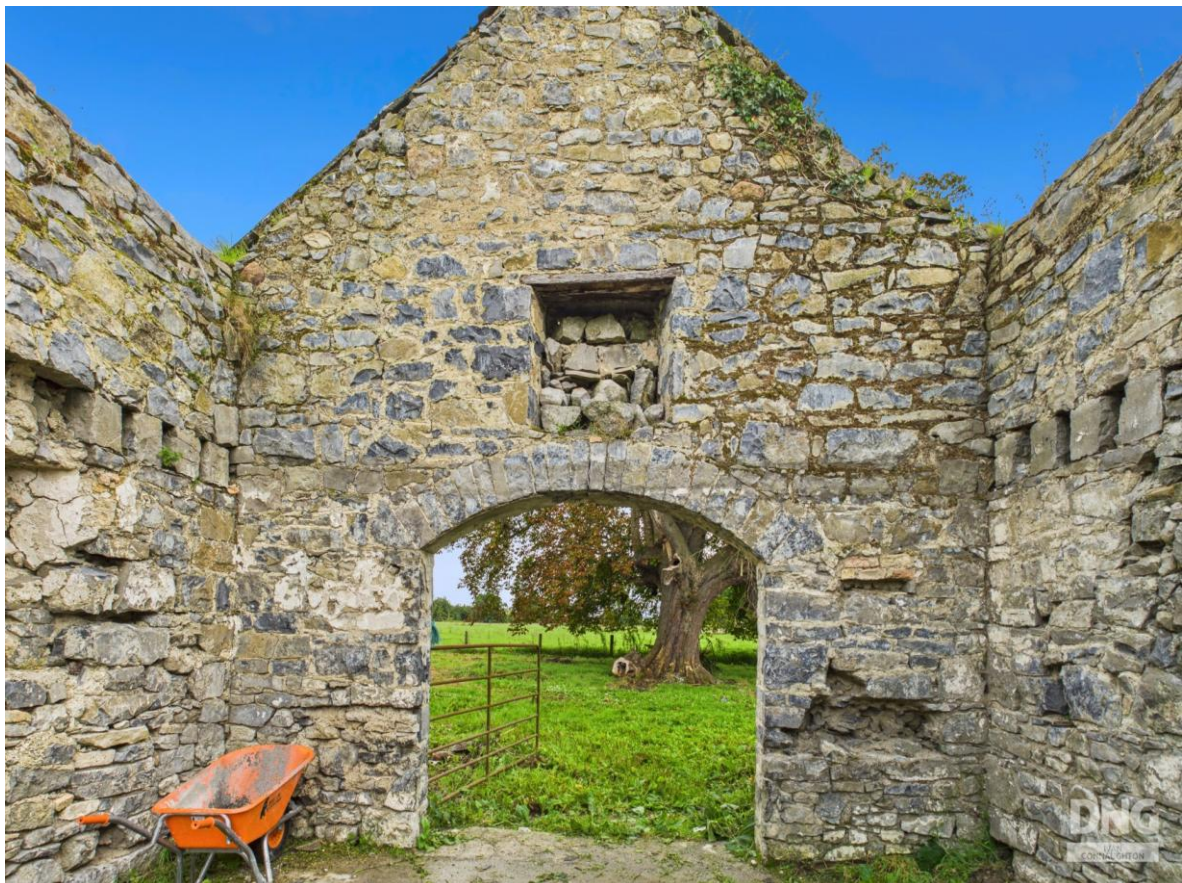
'Frenchlawn House' on c. 85.30 Acres, Frenchlawn, Ballintober, Co. Roscommon. F45 A021