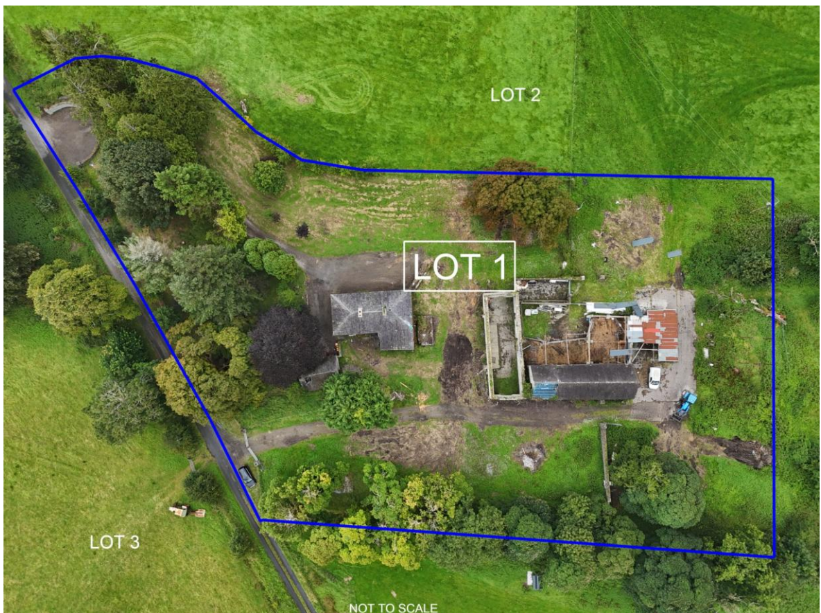
'Frenchlawn House' on c. 85.30 Acres, Frenchlawn, Ballintober, Co. Roscommon. F45 A021