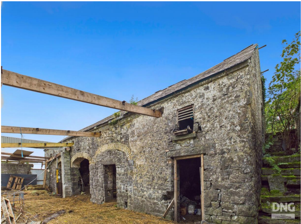
'Frenchlawn House' on c. 85.30 Acres, Frenchlawn, Ballintober, Co. Roscommon. F45 A021