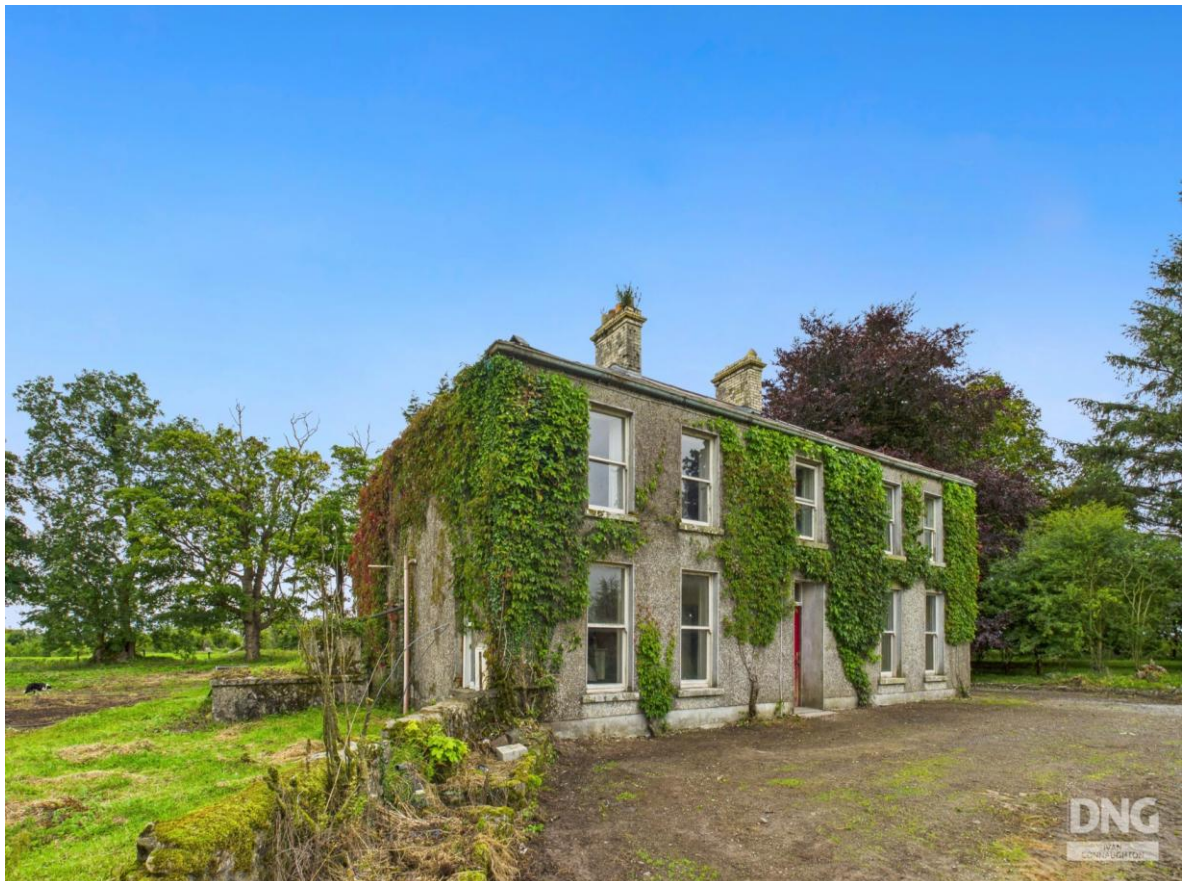
'Frenchlawn House' on c. 85.30 Acres, Frenchlawn, Ballintober, Co. Roscommon. F45 A021