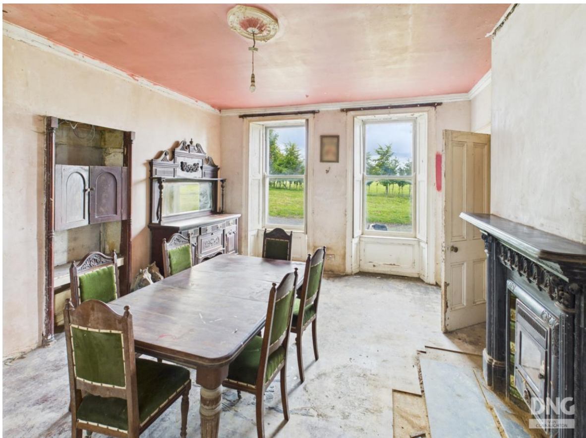
'Frenchlawn House' on c. 85.30 Acres, Frenchlawn, Ballintober, Co. Roscommon. F45 A021